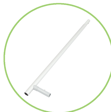
QTY 2: 32" Bottom Tubes