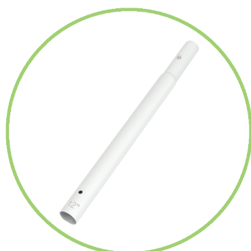
QTY 4: 12" Tubes