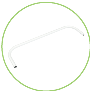
QTY 1: 36" Top Tube