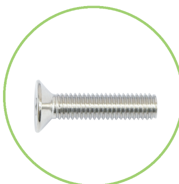
QTY 2: Steel Base Screws