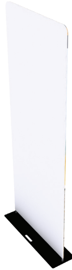
Single-Sided Back View