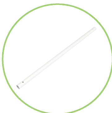
QTY 1: Horizontal Bottom Tube