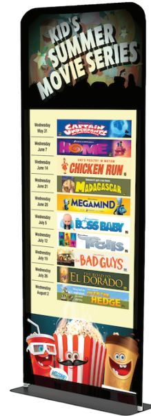
Double-Sided Back View