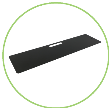
QTY 1: Steel Base