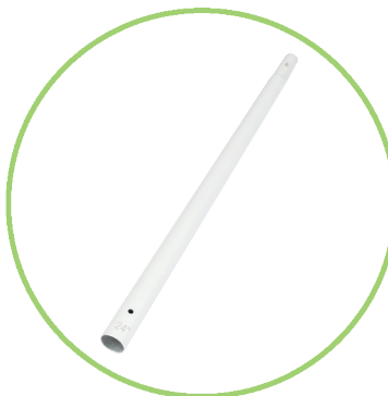
QTY 2: 24" Tubes