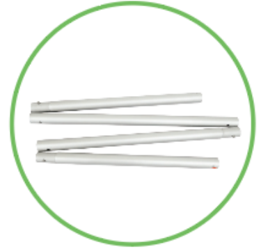
QTY 1: Top Horizontal Tube Set