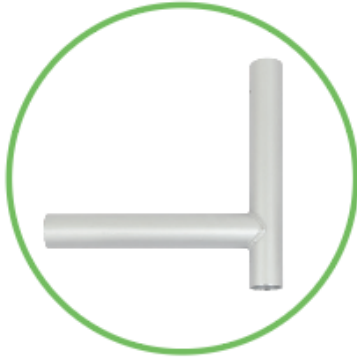
QTY 2: Bottom Corner Connectors