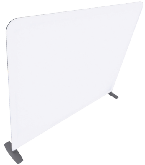
Single-Sided Back View