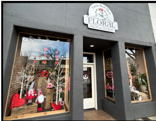
Floral's New Home: 232 Main St.

We are also eager to continue providing all the services that put you are used to. Our quality delivery and wedding services have continued uninterrupted by the big move. We also have a few workshops just around the corner, so be sure to keep an eye out for those!