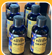
All The Bitter

The merchandise available at our HOME store is always high quality. We want to highlight some particularly special brands: