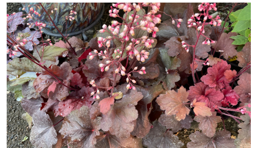
Fire Alarm Coral Bells