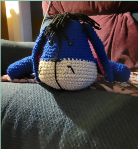
Savannah W. - Crocheted Eeyore

Little Red Hen has a plethora of artistically inclined and creatively minded people. This page is dedicated to showcasing their art.