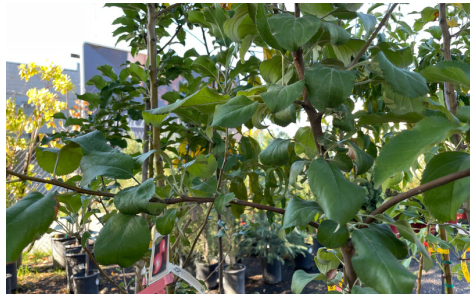
Apple Trees at the Nursery

They require full sun, well-draining soil, partner trees for cross-fertilization, and good air circulation to thrive. If you decide to plant one, it's important to take these needs into consideration when you decide where to plant it. When planted, remember to water it regularly and watch out for pests.