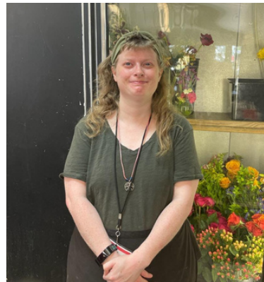
"The one thing that people should know about Little Red Hen is that Little Red Hen is always friendly to their customers." -Klair B.