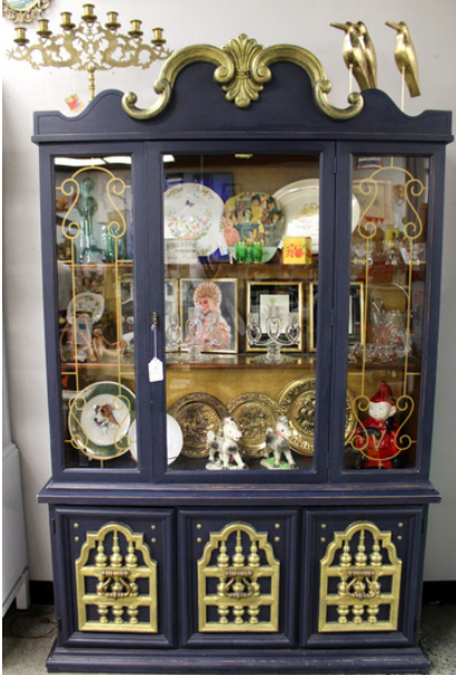
A lovely display