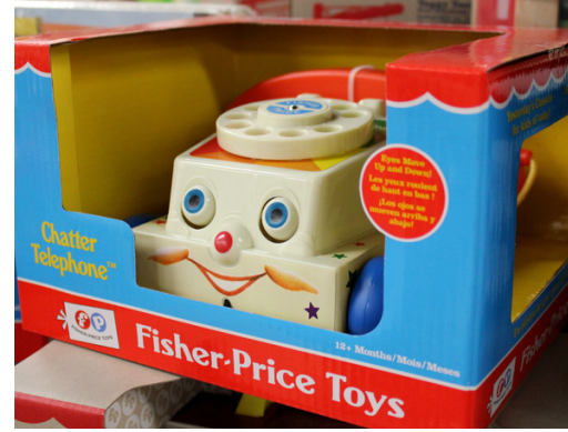
A classic toy

If you enjoy hearing about vintage merchandise, then check out our blog every Saturday to learn about some of the history and memories connected with our products.