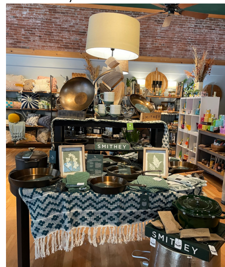
a HOME store display

Why do we work so hard at making our stores beautiful and shoppable? "Retail with a Purpose" is about providing a meaningful shopping experience, selling quality products, and giving our customers the opportunity to support people with disabilities. Our carefully crafted displays help invite our customers to engage with our community.