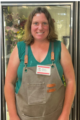
"People should know that when they come in they are supporting people with special needs." -Ashley H.