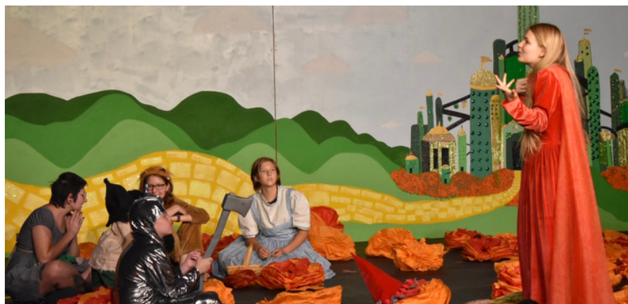
Dorothy & Co sitting beside the yellow brick road

The program meets for six weeks every summer and organizes a production of The Wizard of Oz, usually with some sort of twist.