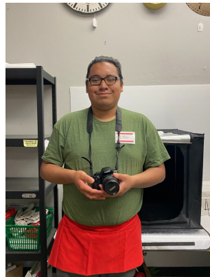
"Little Red Hen travels around the states finding vintage and antique items to bring into the store." -Jeziel S.