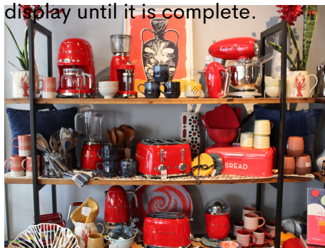
a HOME store display

Little Red Hen HOME store instructor Marissa W. feels that displays can be a great exercise in creativity. However, the creative process can, of course, be challenging. According to Marissa, the hardest part of setting up displays is often not having a clear vision for the display until it is complete.