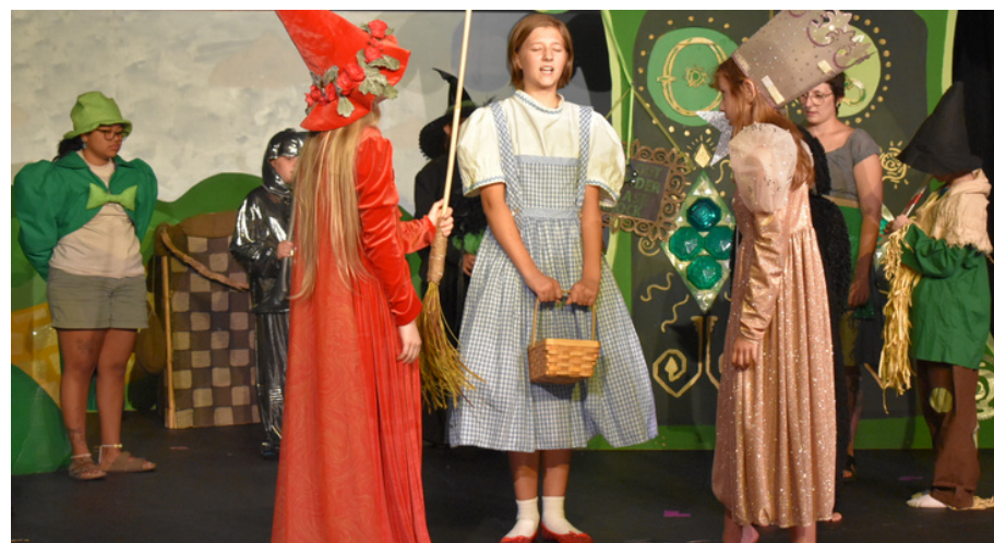
Above: Dorothy wishing to go home