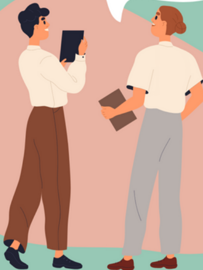
Identity First Language