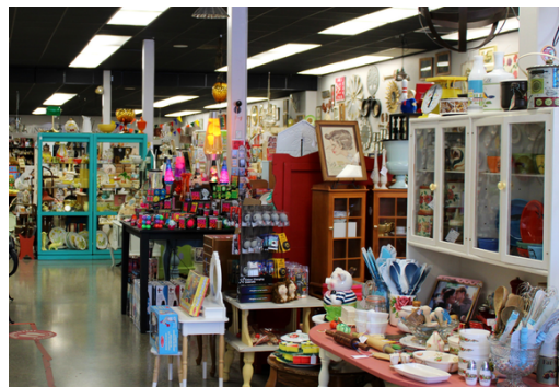
A look inside Vintage