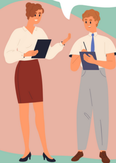
Person First Language