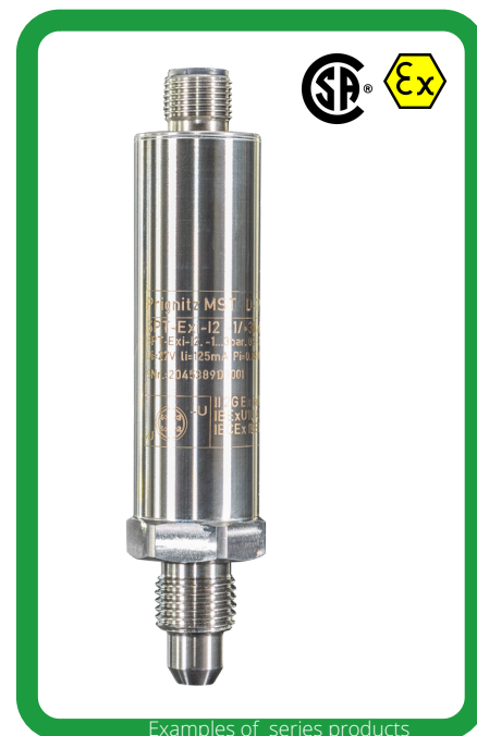
Examples of series products