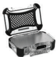
Aluminum panel kit