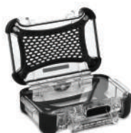
Lexan panel kit