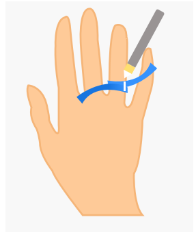
Step 2 When you have wrapped it around your finger and the paper meets the starting edge, gently fold it or mark a point using a pen.