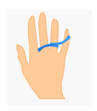
Step 1 Wrap a strip of paper around your flinger where you'd like your ring to be.