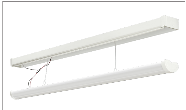
EASY FOR INSTALLATION