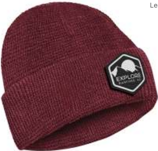
BORDEAUX Leather Patch

Experience the ultimate in outdoor style and comfort with the Fisherman Beanie from Pacific Headwear. This beanie is crafted from 100% acrylic and features a shorter fit for a fashionable look that is perfect for outdoor enthusiasts of all ages. The 2.5-inch rolled cuff makes decoration a breeze and adds a stylish touch to this already fashionable beanie.