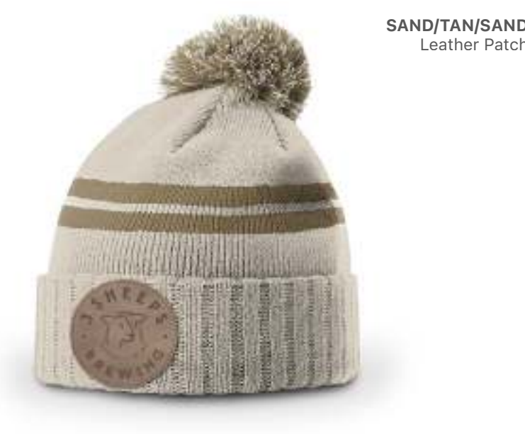
SAND/TAN/SAND Leather Patch