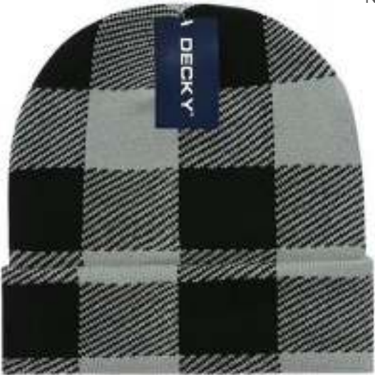
BLACK No Embroidery