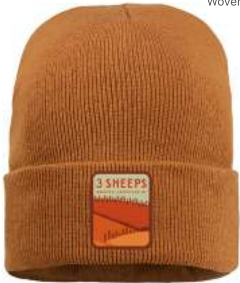
COYOTE BROWN Woven Patch Embroidery