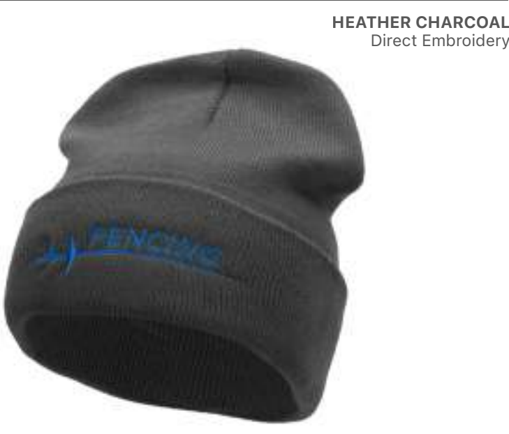
HEATHER CHARCOAL Direct Embroidery