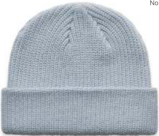
POWDER No Embroidery

Embrace the hottest cap of the season with the Waffle Knit Cuff Beanie from Pacific Headwear. Its stylish colorways and ultra-comfortable fit make it a must-have accessory. The waffle knit texture adds a trendy and distinctive look to this beanie. Whether adorned with a genuine leather or woven patch, this cap is sure to make a statement.