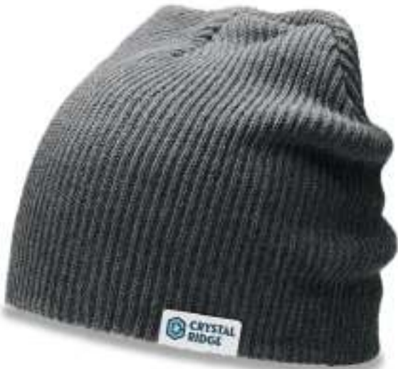
HEATHER CHARCOAL Woven Clip Label