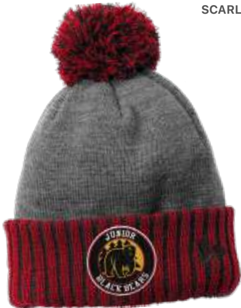
SCARLET/HEATHER GREY Direct Embroidery