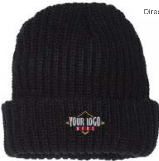
BLACK Direct Embroidery