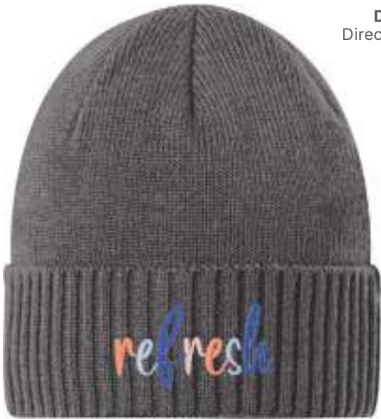
DEEP SMOKE Direct Embroidery

Discover the AS Colour Cuff Beanie, a timeless fisherman style hat crafted from mid-weight 100% acrylic. Featuring a wide, ribbed knit for a snug fit in one size fits all. Customize with a tear-out AS Colour label for a personal touch.