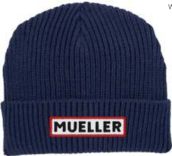
NAVY Woven Patch