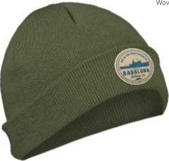
LODEN Woven Patch