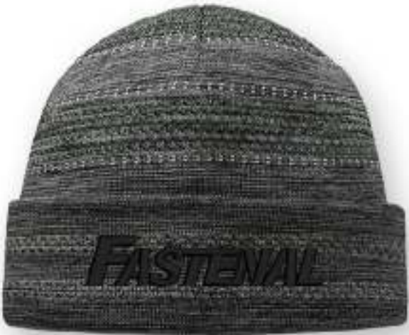
BLACK Direct Embroidery