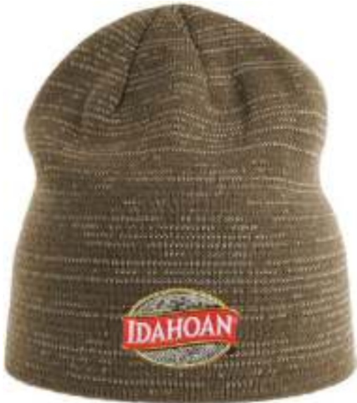
OLIVE Direct Embroidery