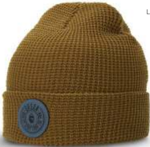
WHEAT Leather Patch