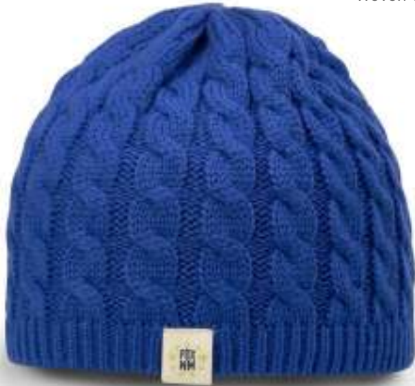
ROYAL Woven Clip Label