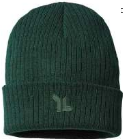
GREEN BOTTLE Direct Embroidery