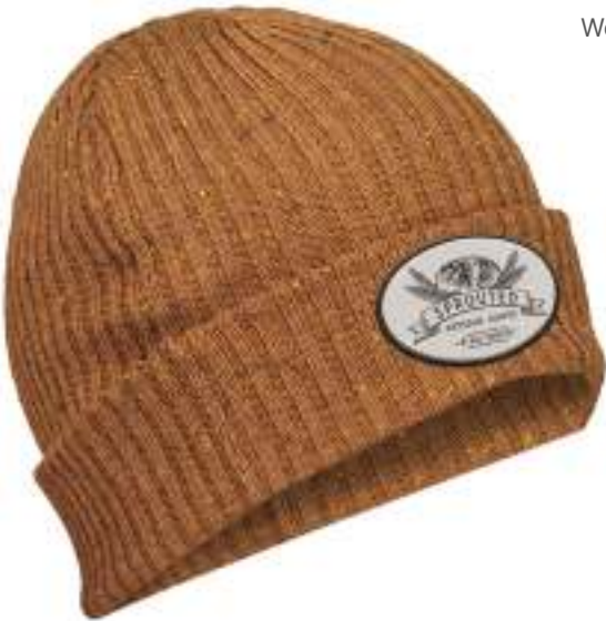
LODEN Woven Patch