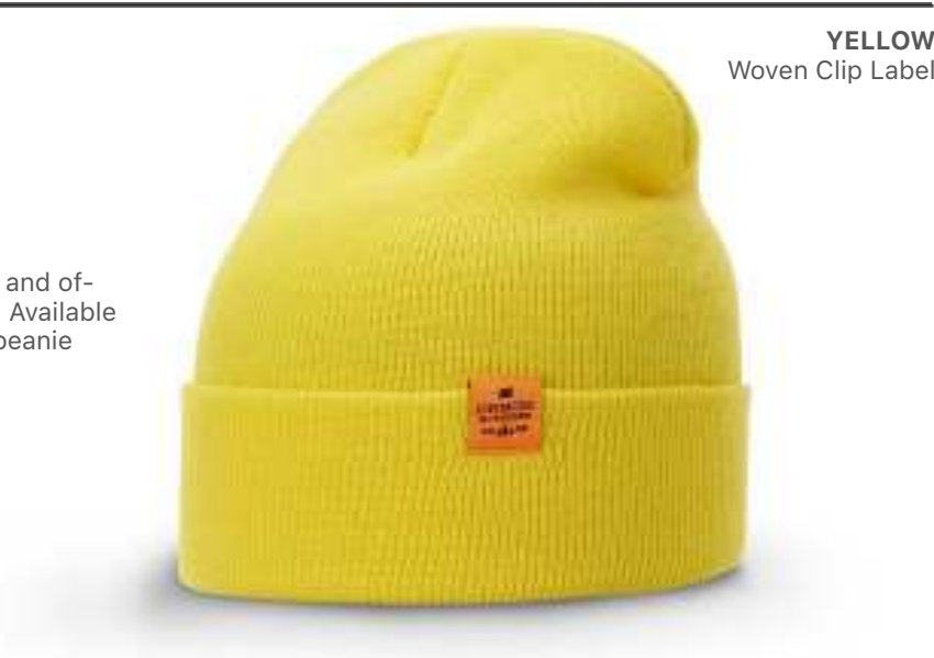
YELLOW Woven Clip Label