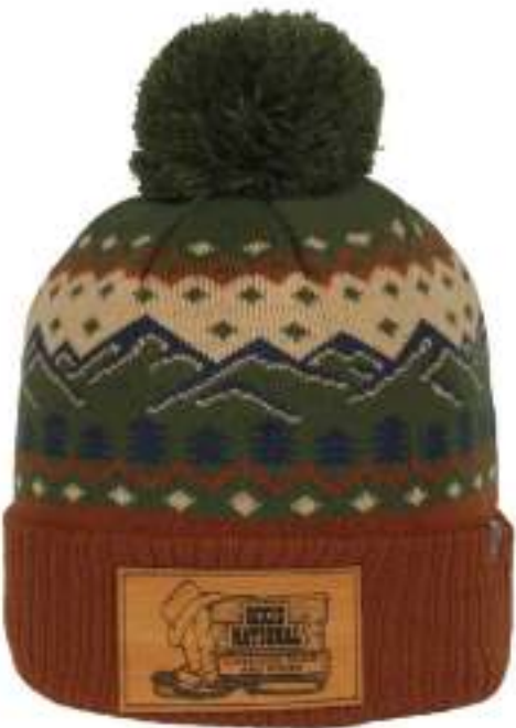
MOUNTAIN Leather Patch

Stay warm and stylish with the Imperial The Montage Pom Cuffed Beanie, perfect for chilly days and outdoor adventures. Constructed from a blend of 95% acrylic and 5% polyester, featuring confetti flecked yarn and a grey fleece lining for added warmth and comfort.