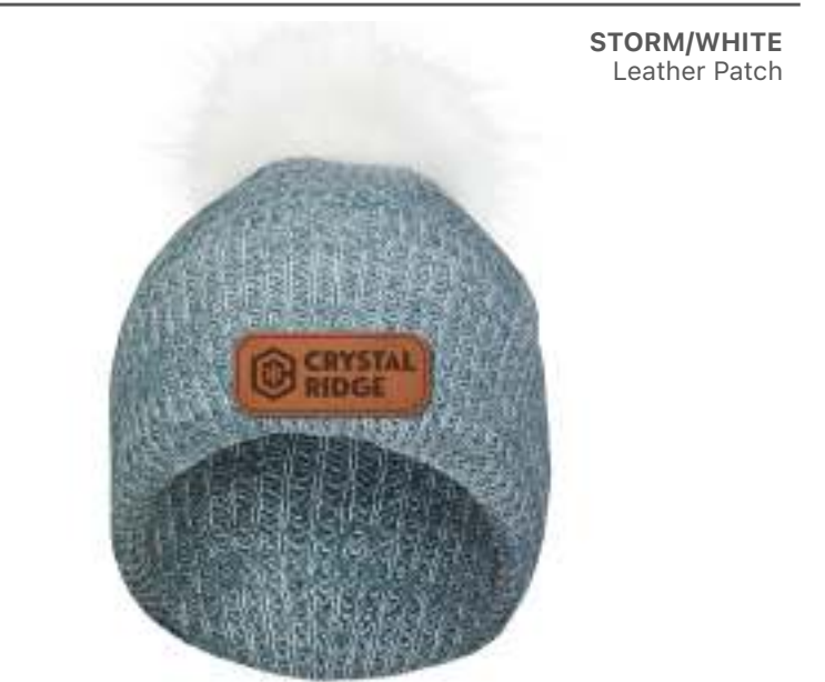
STORM/WHITE Leather Patch