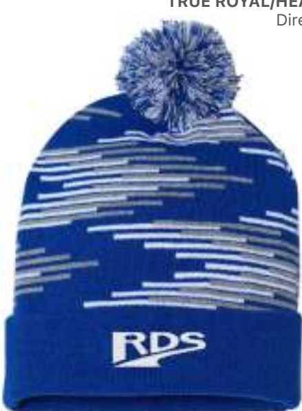
TRUE ROYAL/HEATHER/WHITE Direct Embroidery