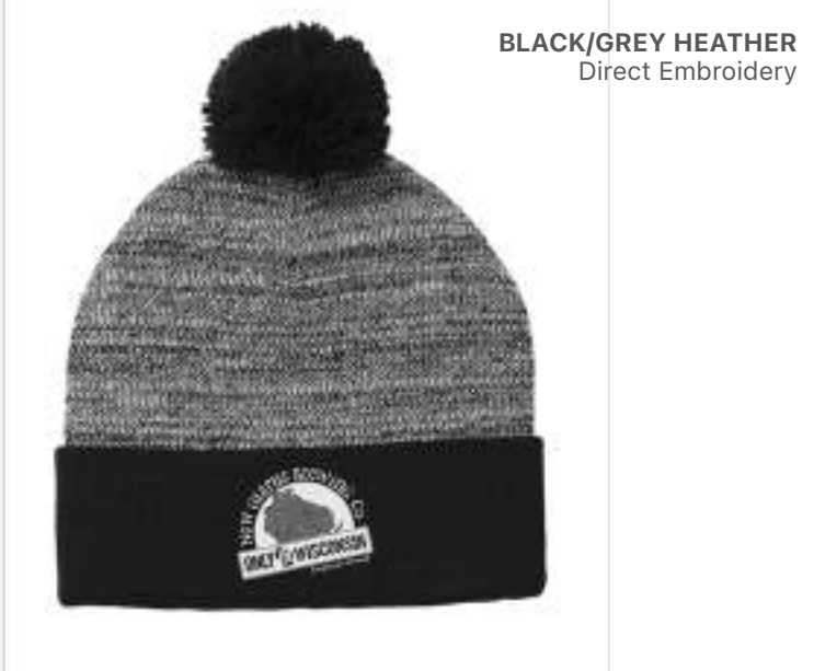
BLACK/GREY HEATHER Direct Embroidery