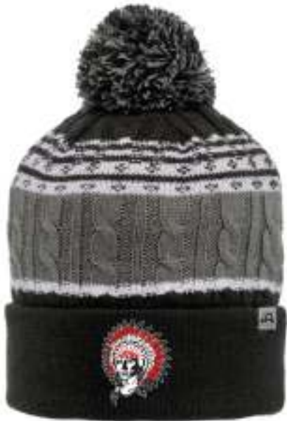
BLACK Direct Embroidery