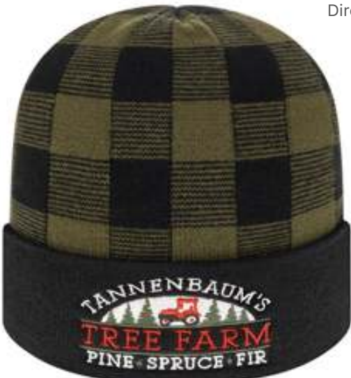
OLIVE GREEN/BLACK Direct Embroidery