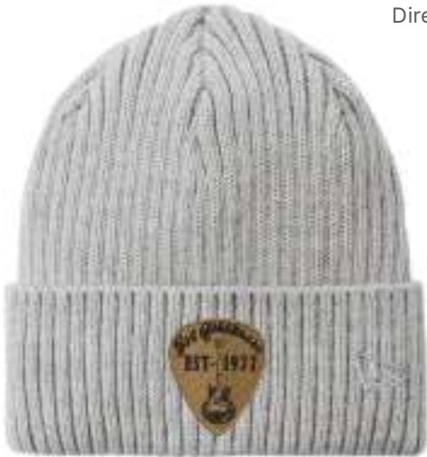
HEATHER GREY Direct Embroidery