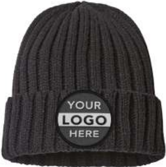
BLACK Woven Patch