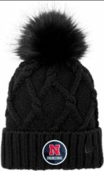
BLACK Woven Patch