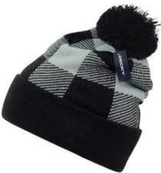
BLACK No Patch