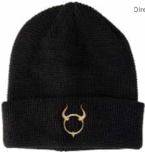
DEEP BLACK Direct Embroidery