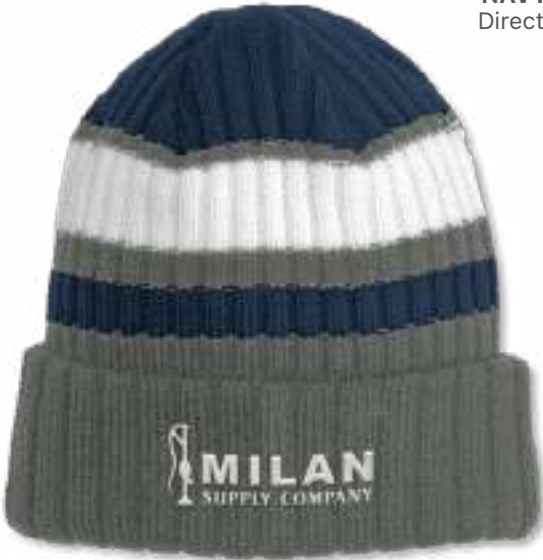
NAVY/GRAPHITE Direct Embroidery