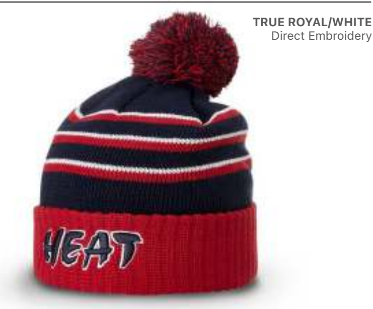
TRUE ROYAL/WHITE Direct Embroidery