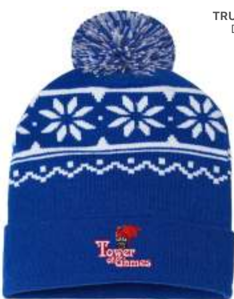
TRUE ROYAL/WHITE Direct Embroidery