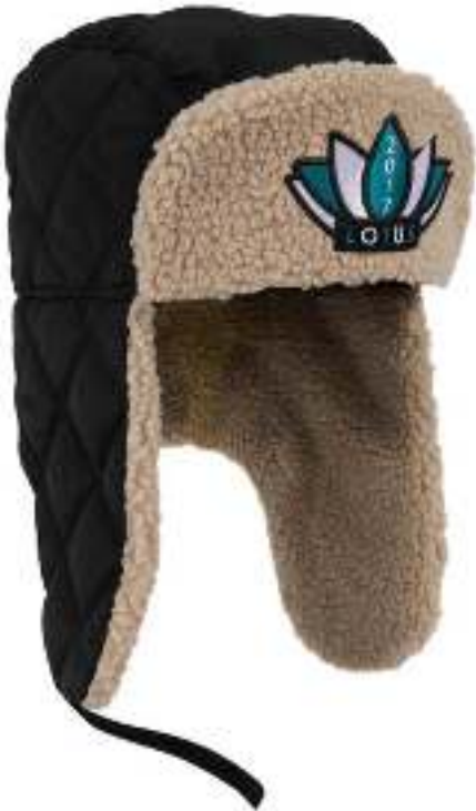
BLACK Woven Patch