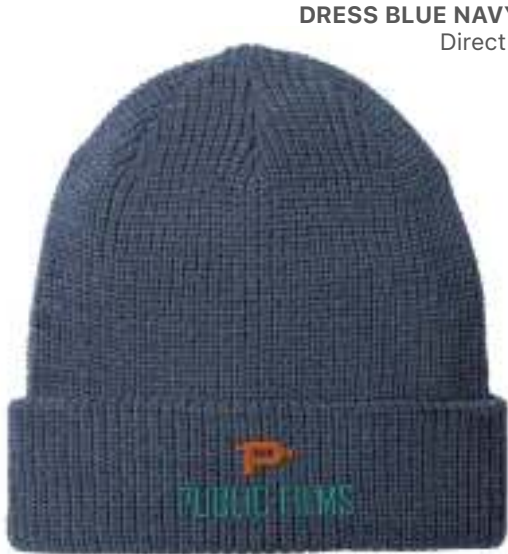
DRESS BLUE NAVY HEATHER Direct Embroidery