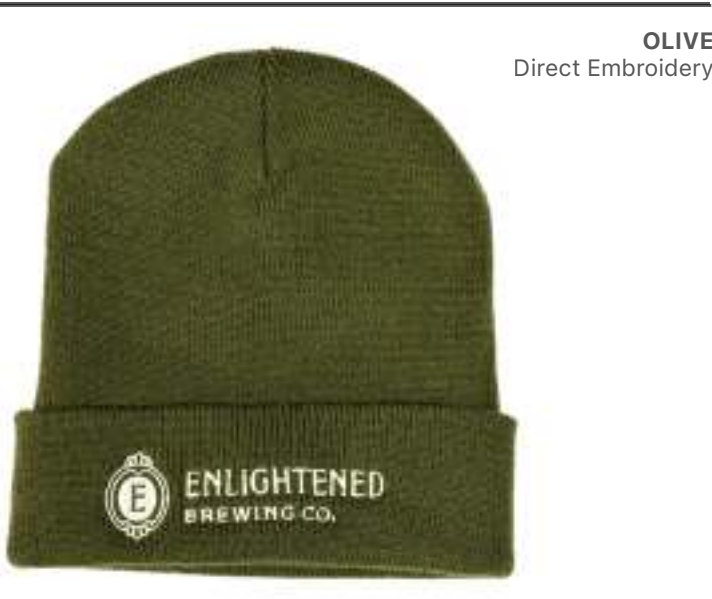
OLIVE Direct Embroidery