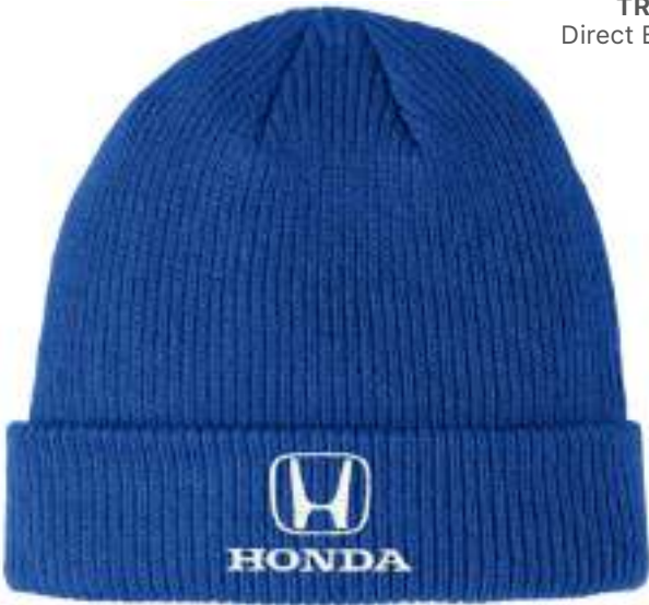
TRUE ROYAL Direct Embroidery