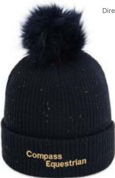
NAVY Direct Embroidery