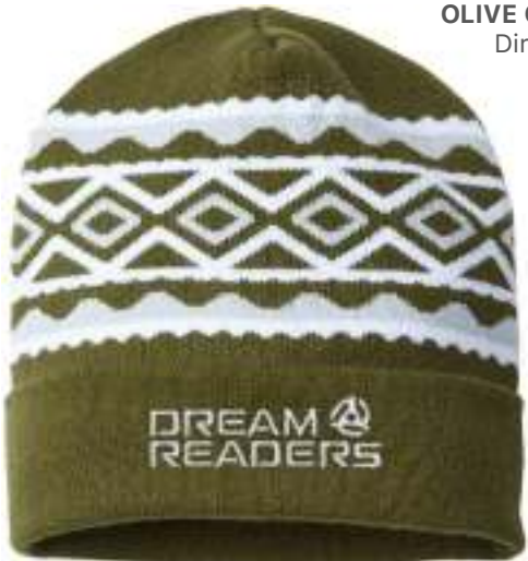
OLIVE GREEN/SILVER Direct Embroidery