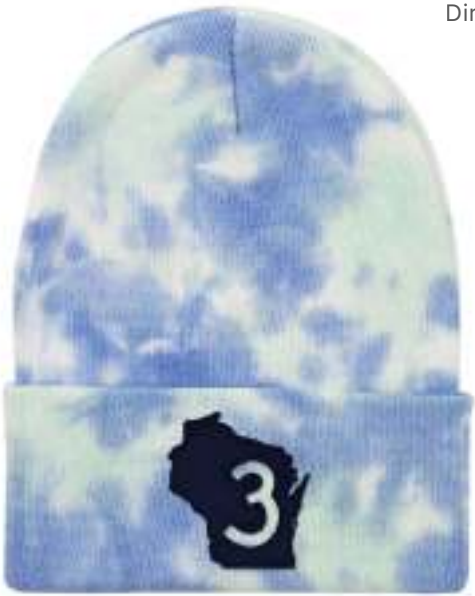
SKY Direct Embroidery