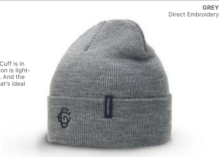
GREY Direct Embroidery