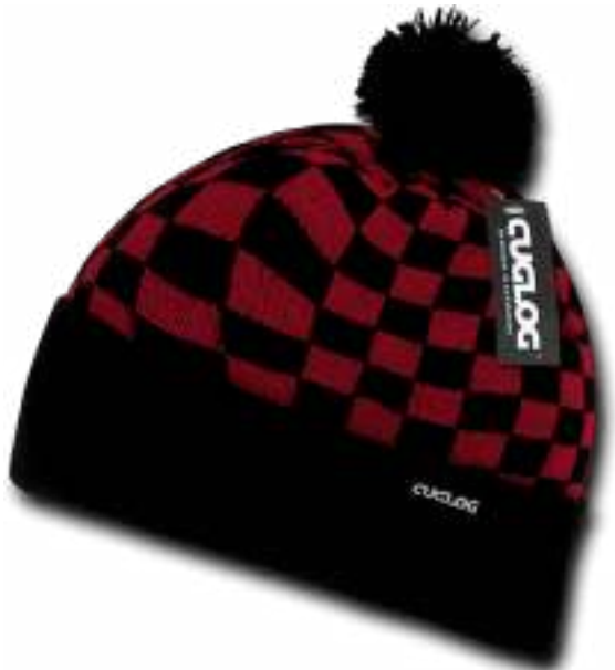
RED/BLACK No Patch