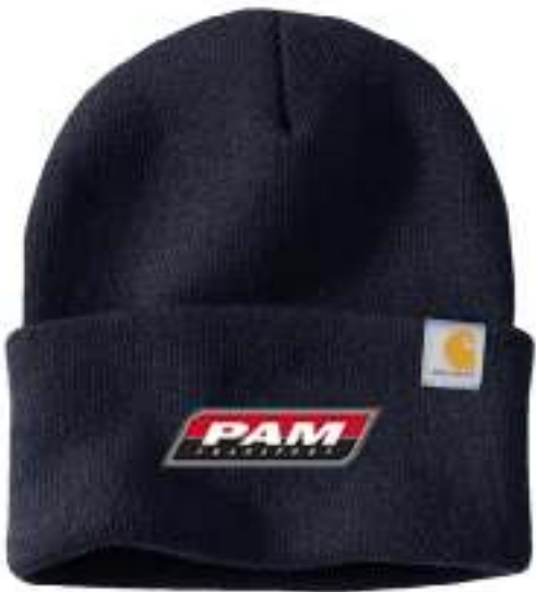
CAROLINA BLUE No Embroidery