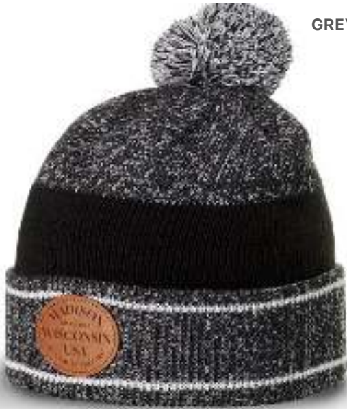
GREY/WHITE/BLACK Leather Patch