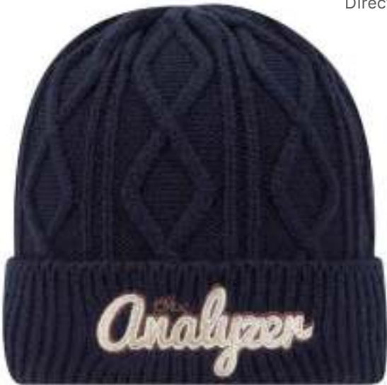
NAVY Direct Embroidery