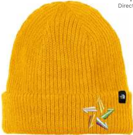
TNF YELLOW Direct Embroidery