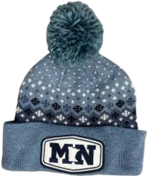
SLATE Woven Patch

The KNF-WILD is WILD indeed. This watch cap features a 3” cuff and a tonal pom to the colorways. It is a watch cap that features a 3” cuff and is an acrylic knit.