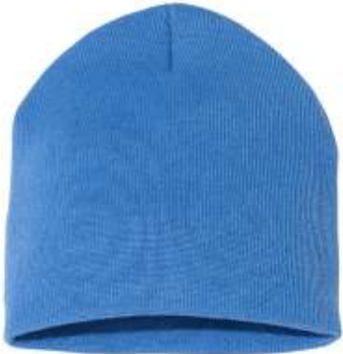
CAROLINA BLUE No Embroidery