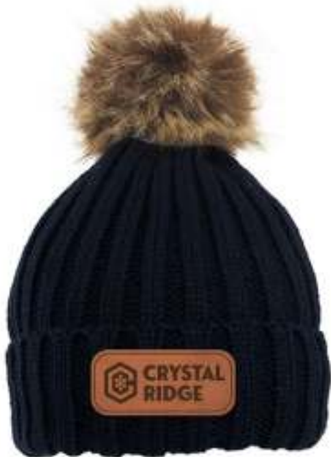
NAVY Leather Patch L1