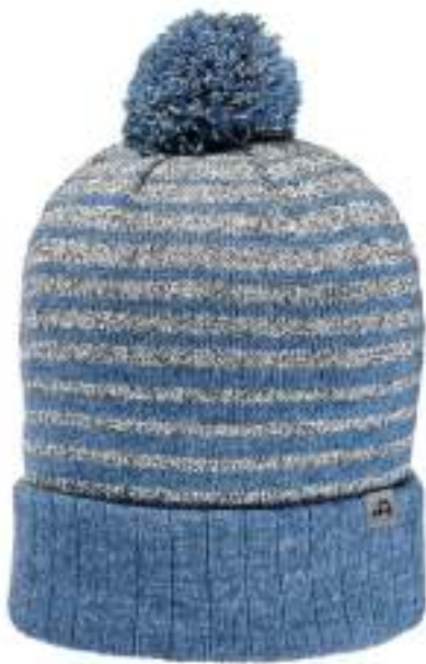
NAVY No Embroidery