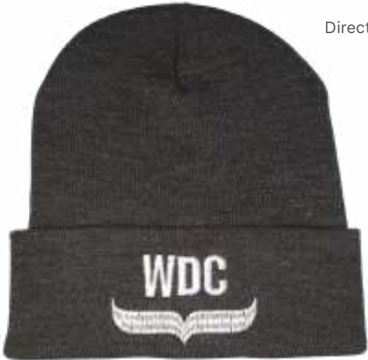
DARK GREY Direct Embroidery