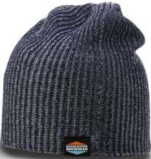
ROYAL Woven Clip Label