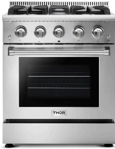
Product: 30 Inch Professional Gas Range in Stainless Steel Model Number: HRG3080U / HRG3080ULP