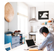
Work from home