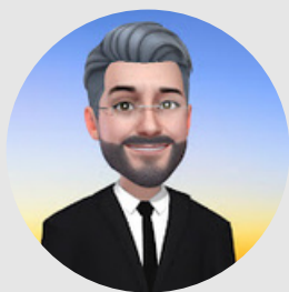
Dragon Hot Dog

Some players have even created educational videos and helpful learning tutorials that they provide, for free. Click on their pic to learn more!