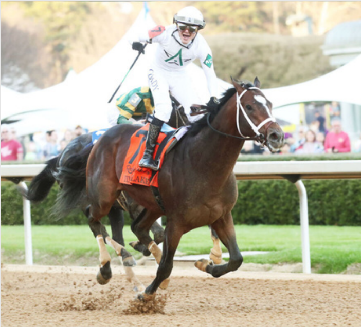
Timberlake wins the Rebel Stakes!