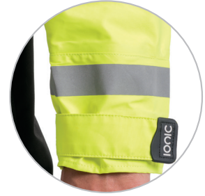
Cuff Covers 30mm reflective detail with velcro® adjustment system

All Cyclone PRO R3 drysuits come complete with quick disconnect adjustable braces