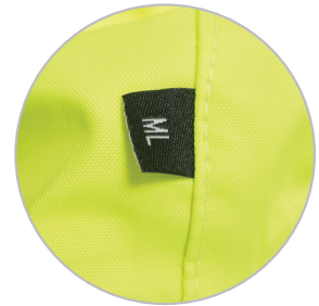
Size Tab Size Tab on rear seam for easy size identification