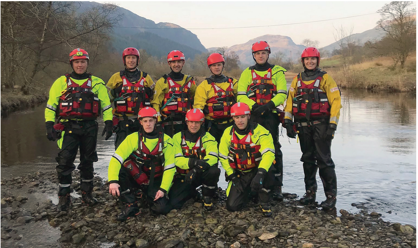
Pictures from Scottish Fire & Rescue Twitter page showing the new IONIC Pro R1 in Fluorescent Yellow