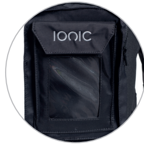
Drysuit Trouser Pocket Zipped pocket with additional window/slate pocket