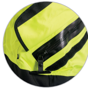
YKK Aquaseal® Zip Zip cover for added protection