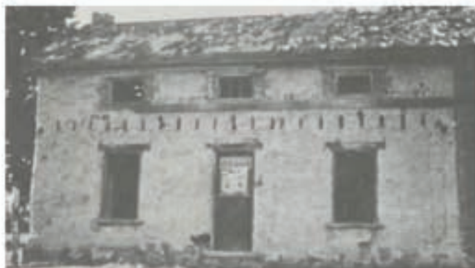
The Hyde Home