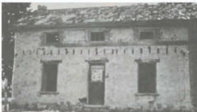
The Hyde Home