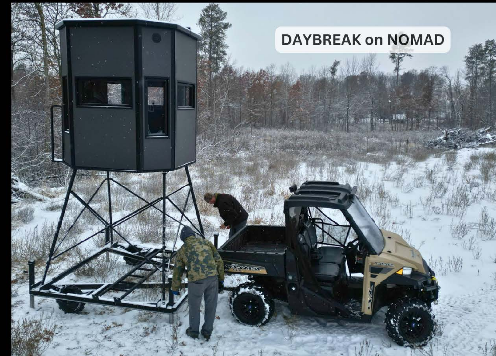
DAYBREAK on NOMAD