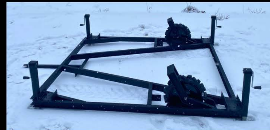
Wheels pivot to accommodate uneven terrain