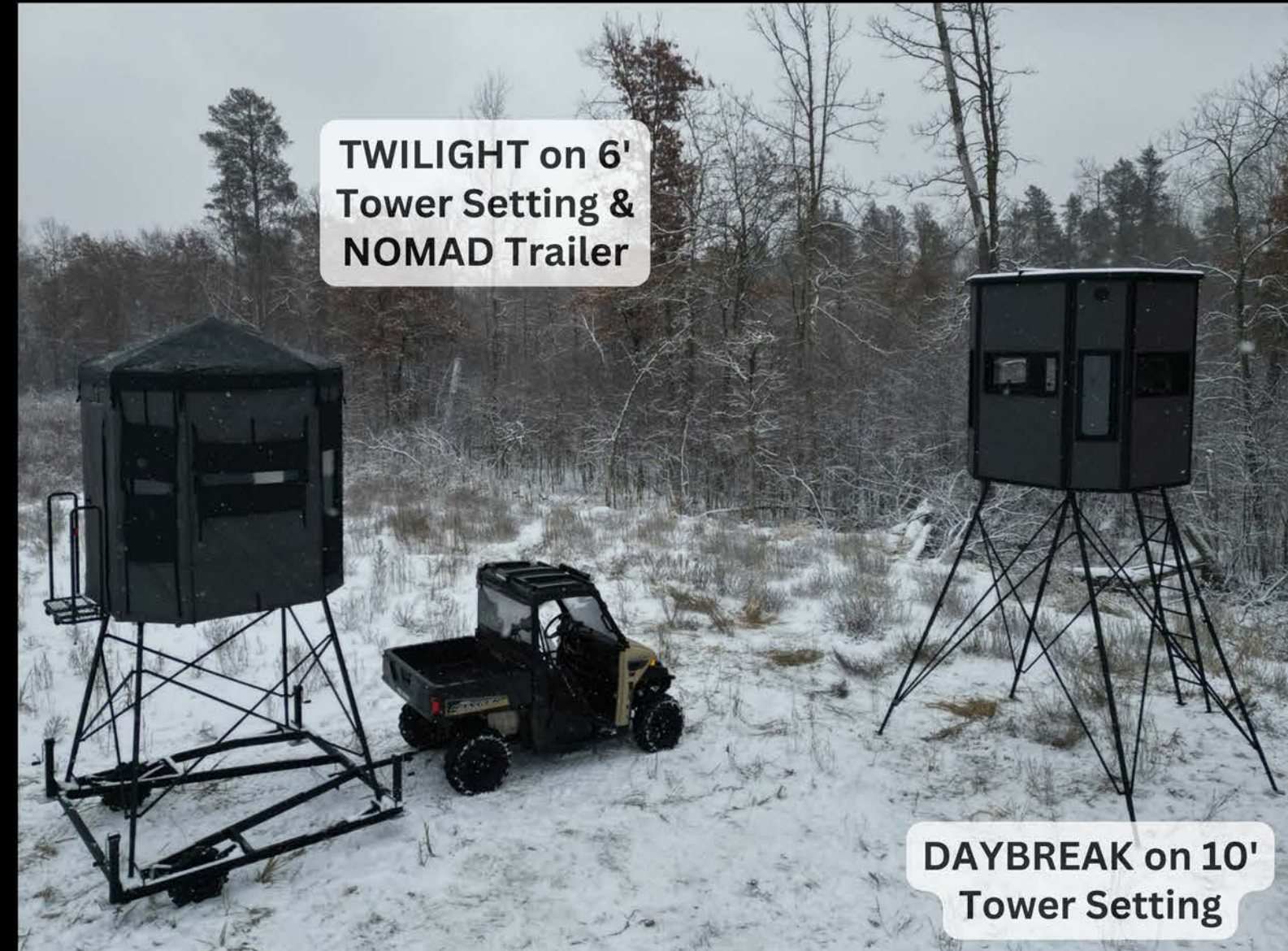
TWILIGHT on 6' Tower Setting & NOMAD Trailer