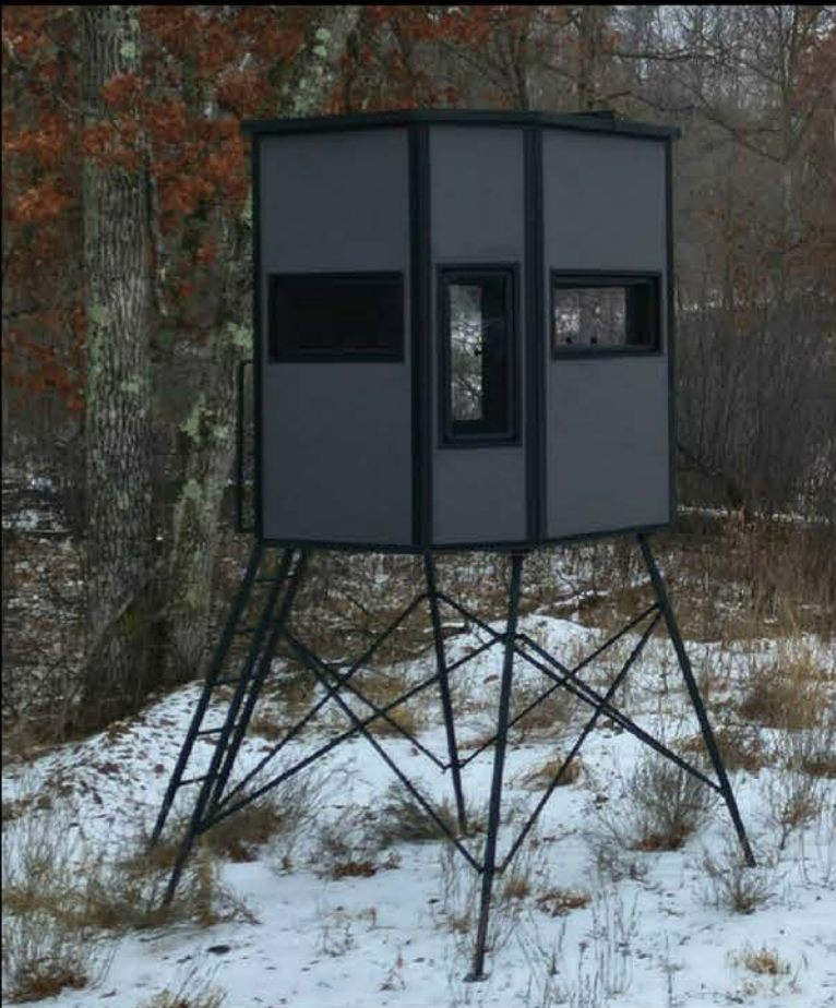
TRANSFORMER Tower at 6' Height