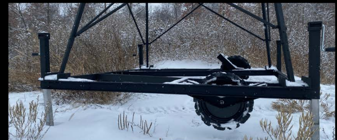
Independently adjustable leveling jacks on all corners