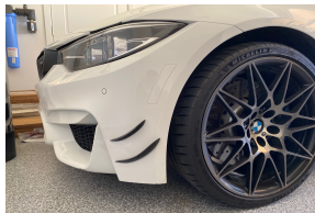
F82 / f32 / M4 / 4-series