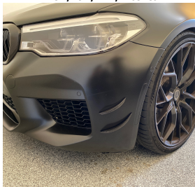
F90 / G30 / M5 / 5-series