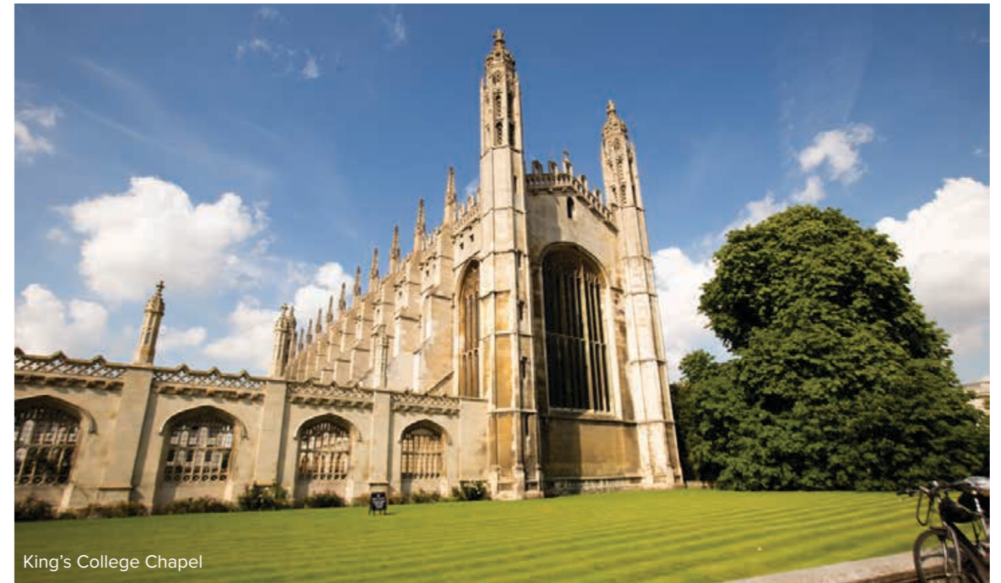
King's College Chapel