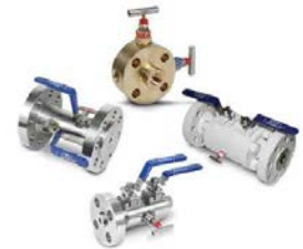
Double Block & Bleed Valves