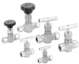
Integral & Union Bonnet Needle Valves