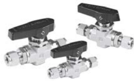
High Pressure Forged Ball Valves