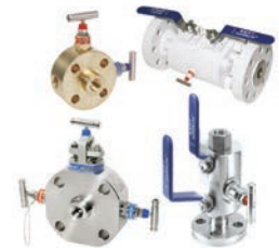
Double Block & Bleed Valves