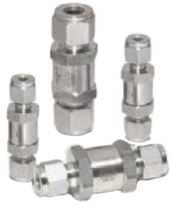
Check Valves & Excess Flow Valves