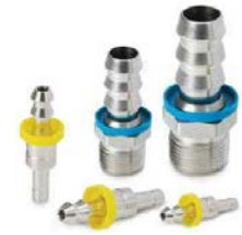
Push-On Hose Fittings