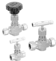
Integral & Union Bonnet Needle Valves