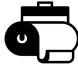
Pulp & Paper