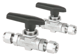
High Pressure Forged Ball Valves