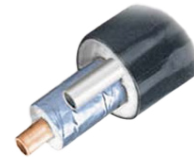
Tube Bundles/ Heat Trace