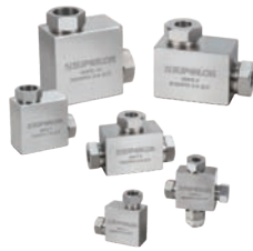
Medium & High Pressure Fittings