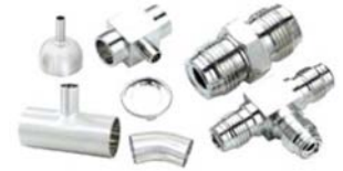
Ultra-High Purity Fittings