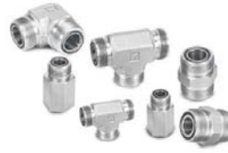
O-Ring Face Seal Fittings