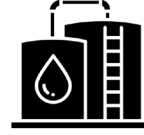
Water & Wastewater