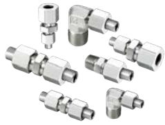
37° Flared Tube Fittings