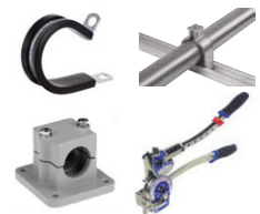
Tube Clamps, Clips & Benders