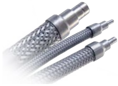
Flexible Metal Hose