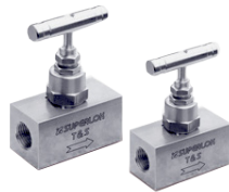
High Pressure Bar Stock Needle Valves