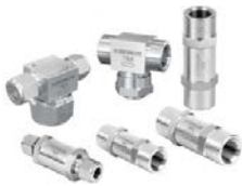
Micron In-line & Tee Filters