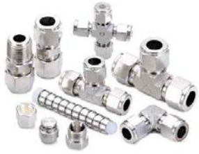
Tube Fittings Double Ferrule