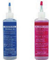
Leak Detection Fluids