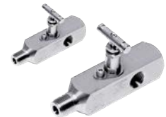
Gauge & Gauge Root Valves