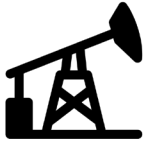
Oil & Gas