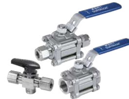
Trunnion & Swing-out Ball Valves