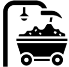
Mining & Minerals