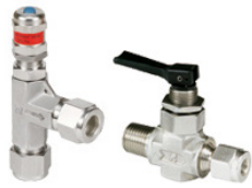
Relief & Toggle Valves