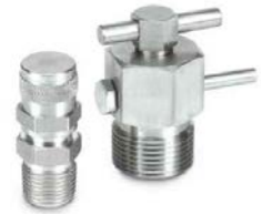
Bleed & Purge Valves