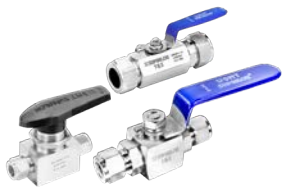
Ball Valves One-, Two- & Three-piece Body