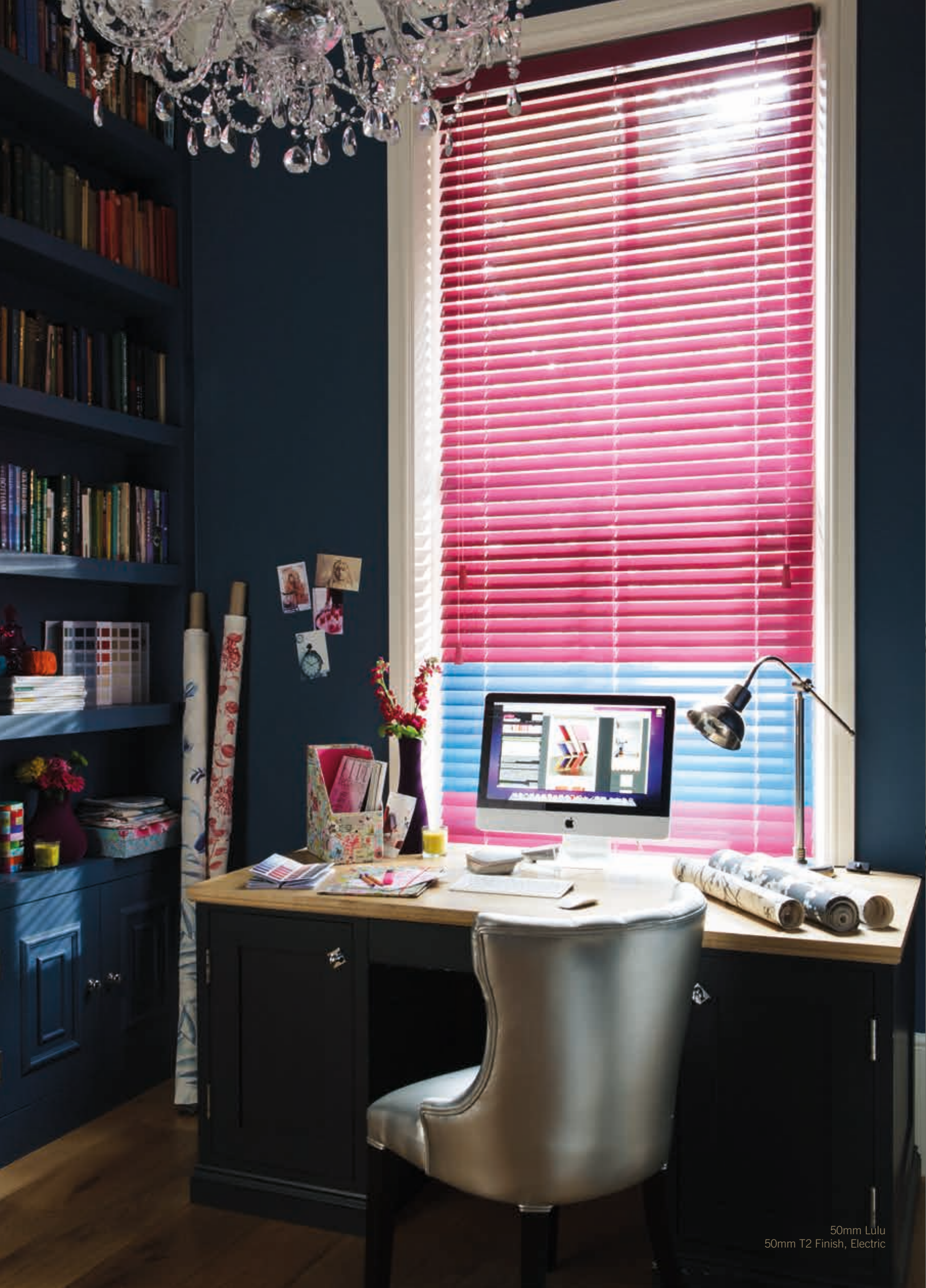
50mm Lulu 50mm T2 Finish, Electric