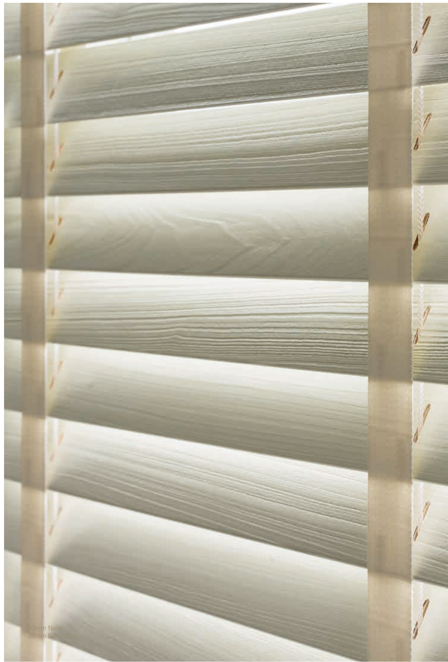
50mm Nata 38mm Echo Tape