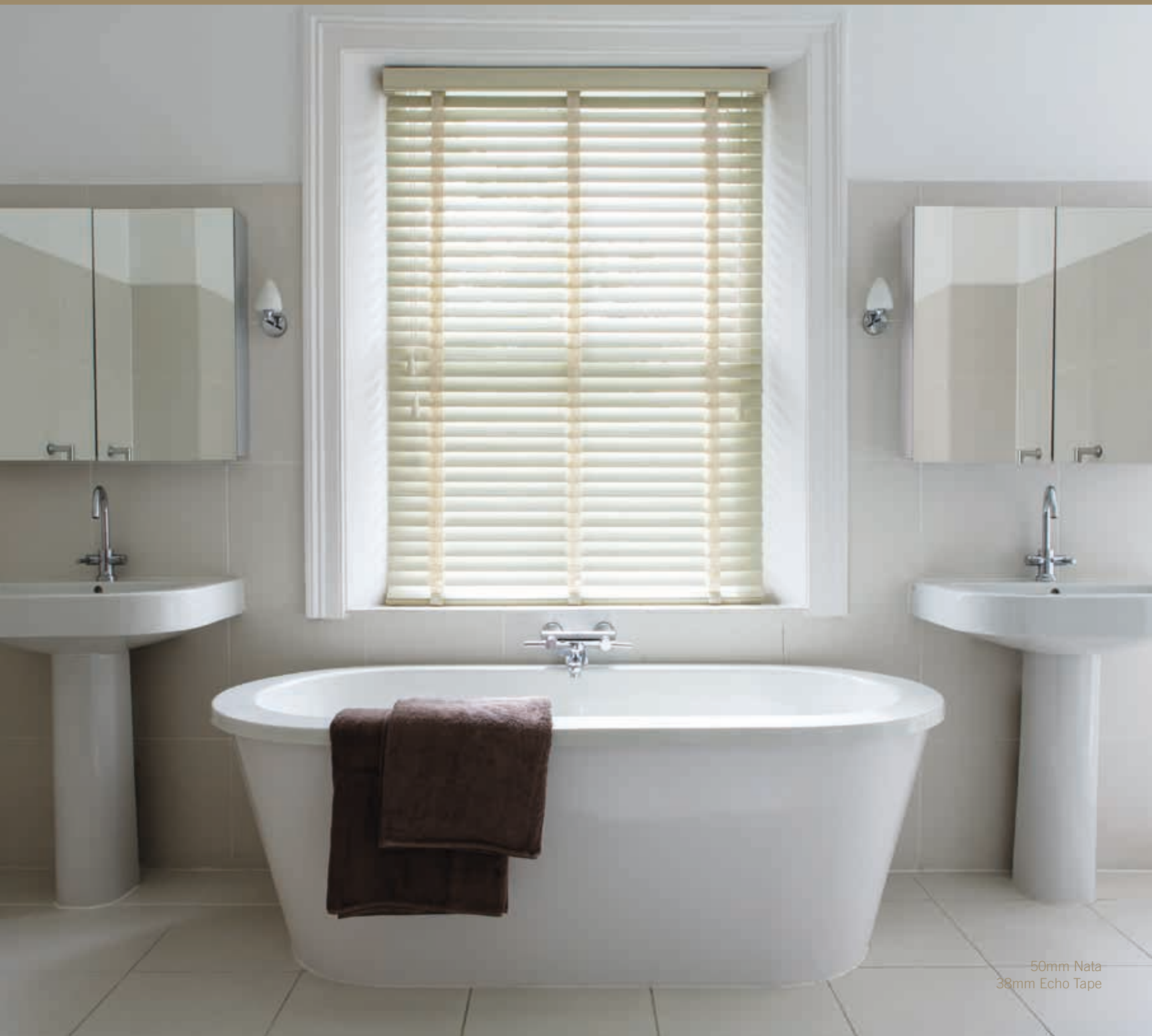
50mm Nata 38mm Echo Tape