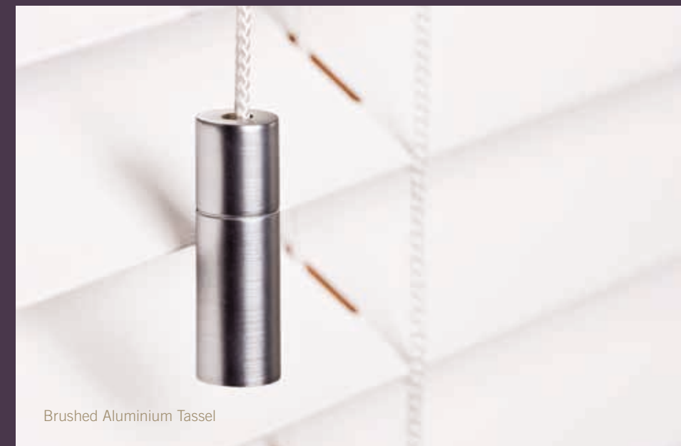
Brushed Aluminium Tassel