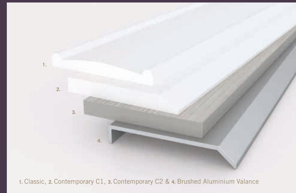
1. Classic, 2. Contemporary C1, 3. Contemporary C2 & 4. Brushed Aluminium Valance