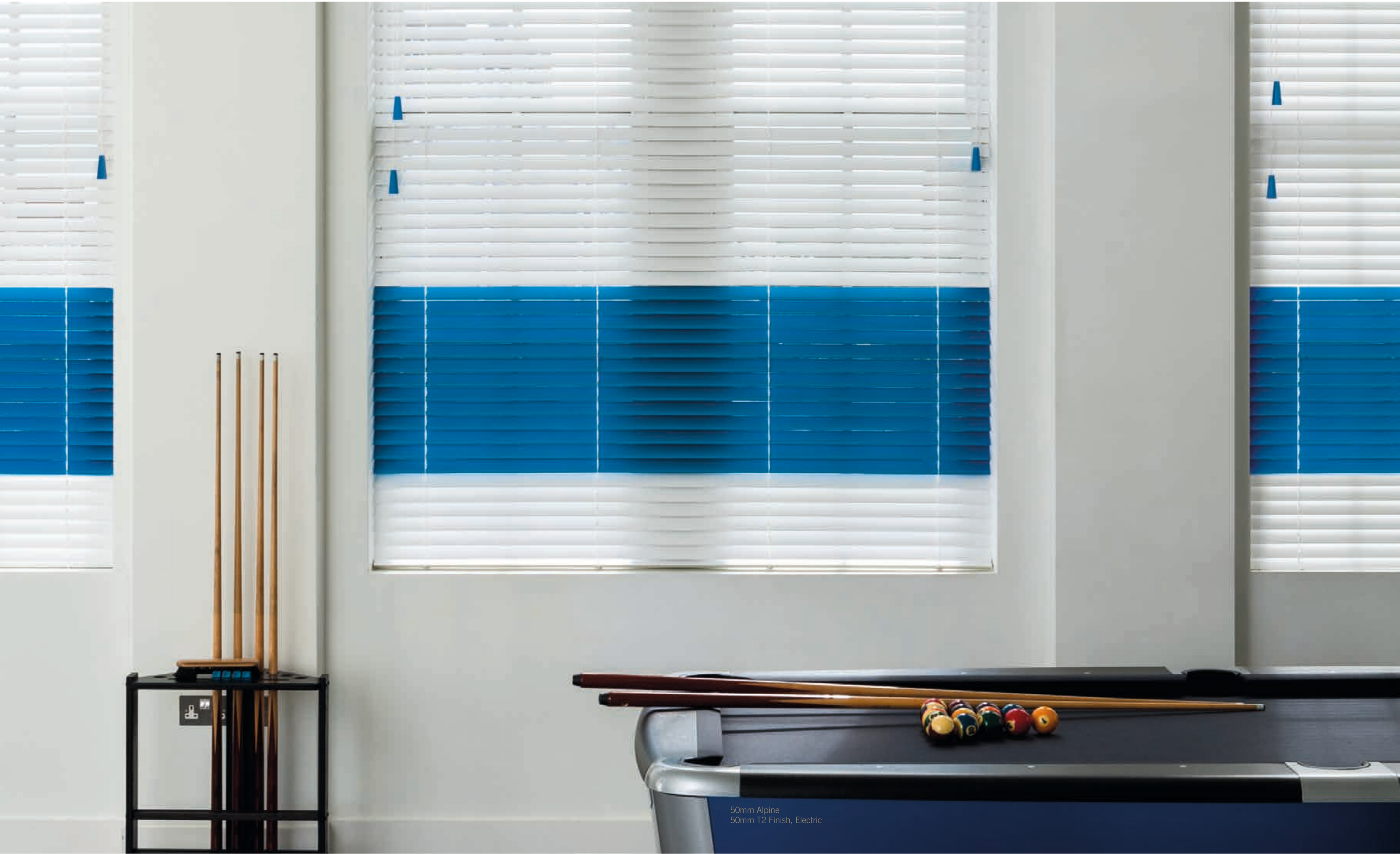
50mm Alpine 50mm T2 Finish, Electric