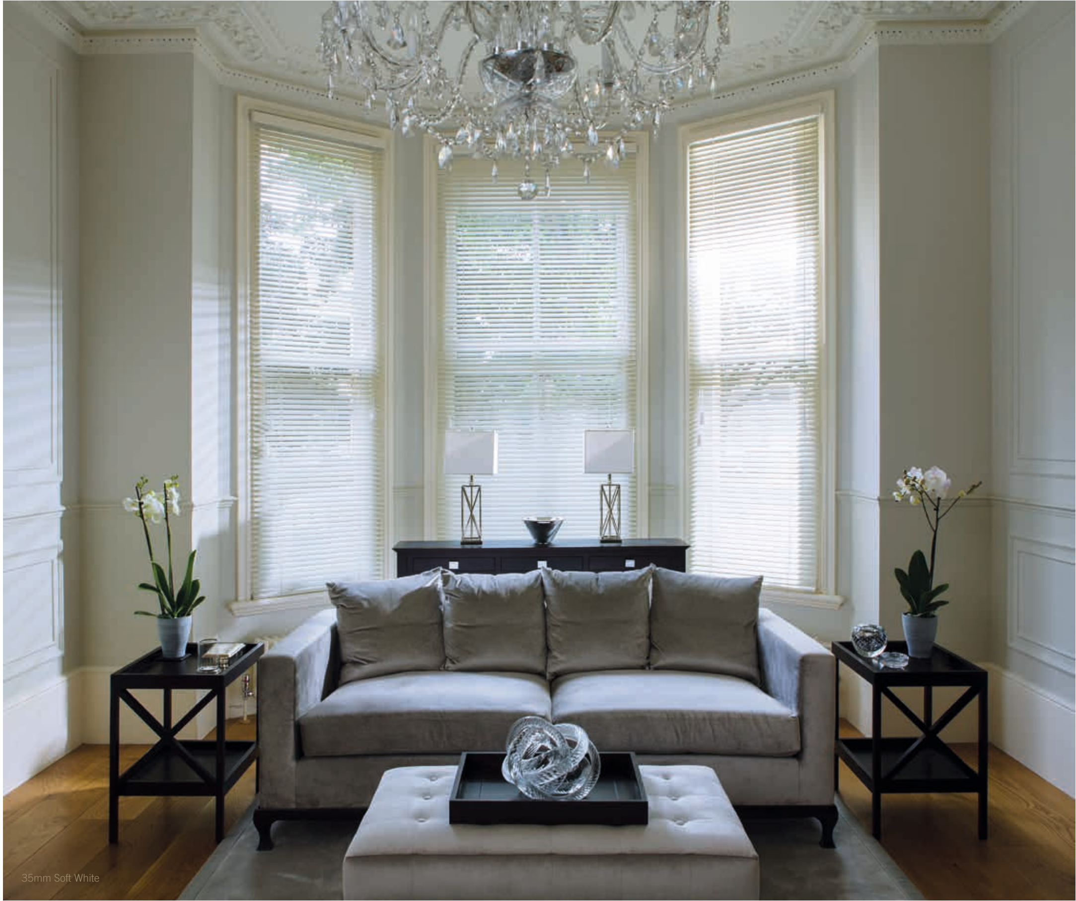
35mm Soft White