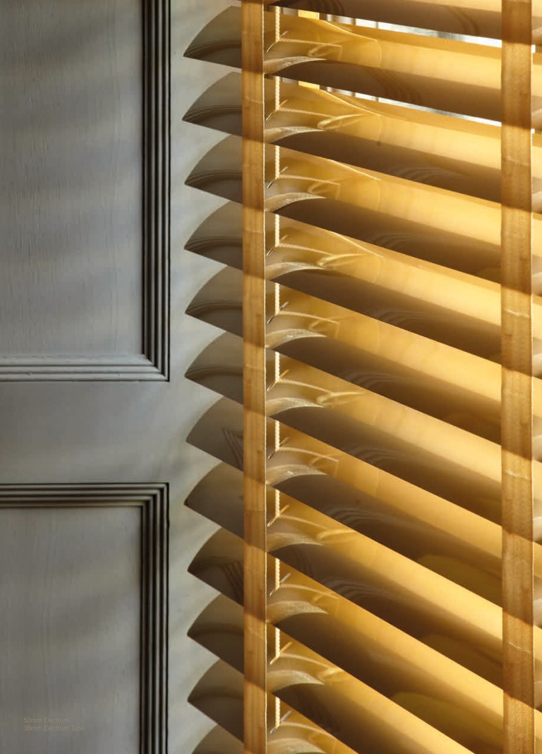
50mm Electrum 38mm Electrum Tape