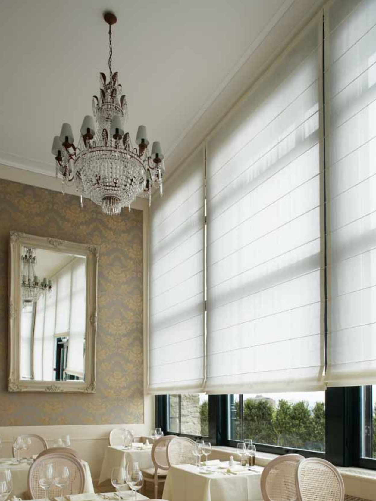
Roman Blind System Silent Gliss 2350