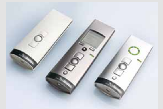
Remote controls Silent Gliss 9940