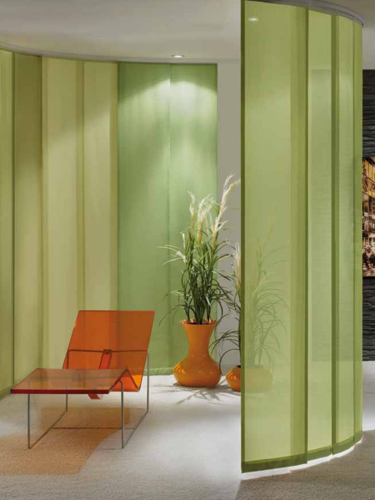
Curved Panel Glide System Silent Gliss 2730 Flex