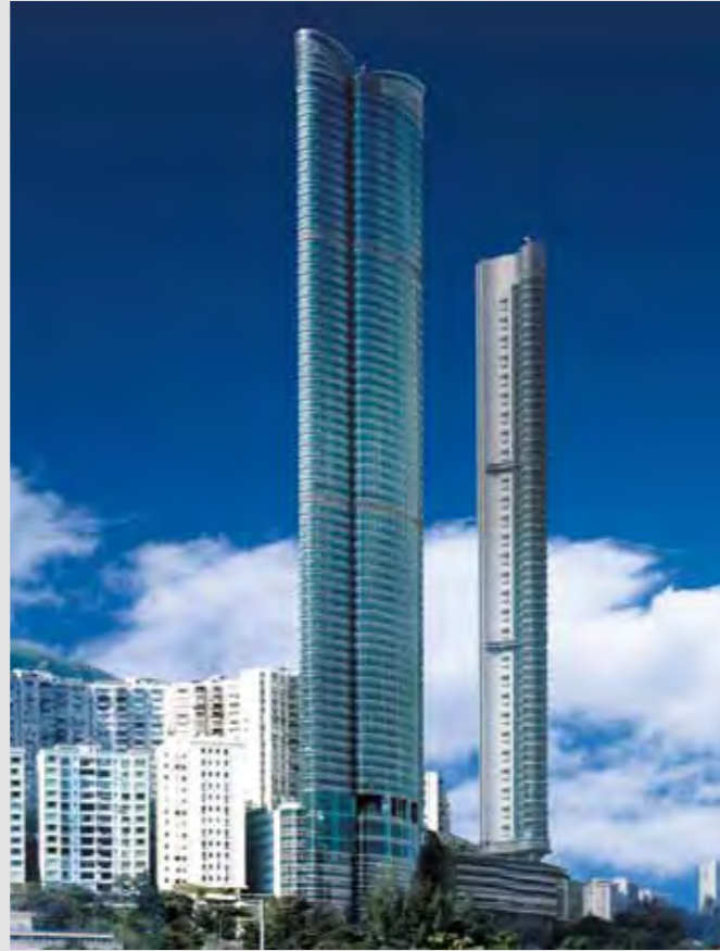
Highcliff / The Summit, Hong Kong, China