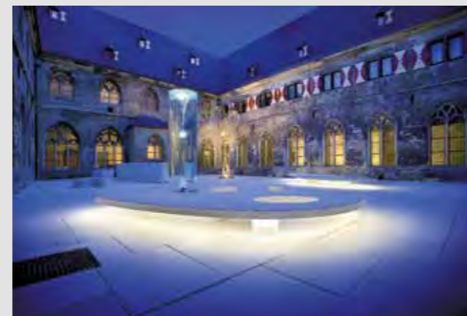
Kruisheren Hotel, Maastricht, The Netherlands

This erstwhile 15 th Century monastery enchants its guests with a unique blend of Gothic architecture and streamlined, modern interiors. The elegant combination of two roller blind systems provides practical screening and glare protection.