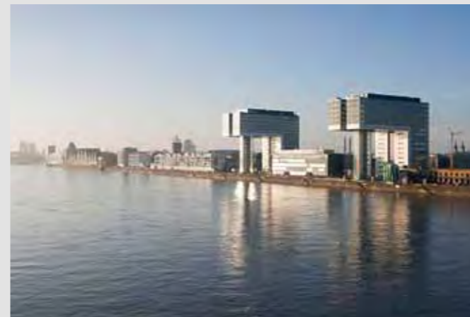
Kranhaus Mitte, Cologne, Germany

The new "Kranhauser" at the Rheinhafen is already a landmark in Cologne. The three buildings include high-end office space and residential apartments. Most are equipped with Silent Gliss systems, for example the new offices of law firm Rodl & Partner.