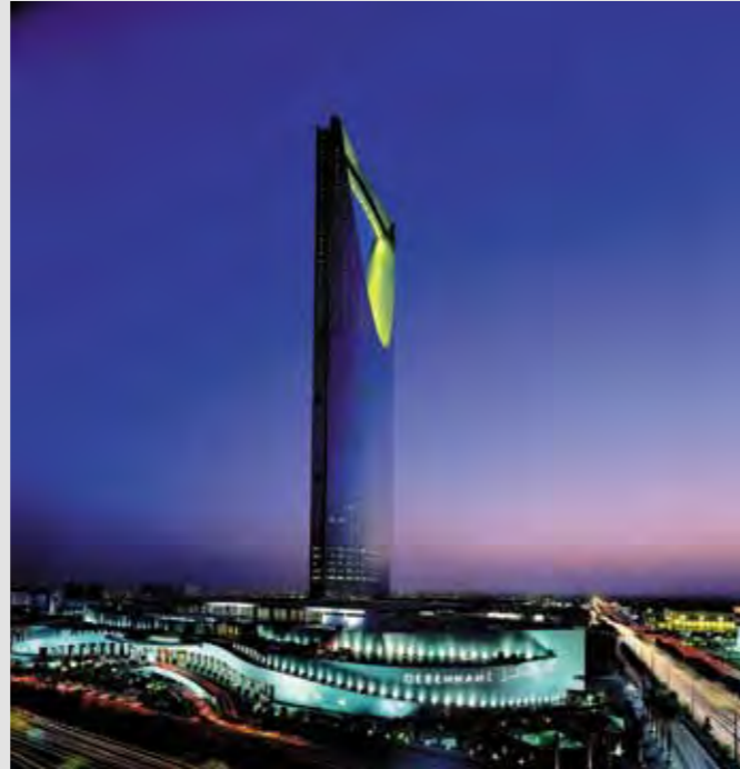
Kingdom Tower, Riyad, Saudia Arabia

Sage H.Q., Gateshead, UK SAB Miller, Woking, UK IFC Tower, Emirates Tower, Dubai, UAE Al Ahli United Bank, Bahrain ADCO H. Q., Abu Dhabi, UAE World Trade Centre, Shenzhen, China The Grand Mosque, Mecca, Saudi Arabia Saab-Scania, Helsinki, Finland Salle Gustave Eiffel, Eiffel Tower, Paris, France IMB-Verwaltung, Munich, Germany Fiat, Turin, Italy Christies, London, UK Dixons H.Q., Hemel Hempstead, UK Eden Project Conference Centre, Cornwall, UK City Hall, Amsterdam, The Netherlands Banque Internationale, Luxembourg Credit Communal, Brussels, Belgium IBM Headquarters, Oslo, Norway Volvo Head Office, Gothenburg, Sweden Bell Canada, Trinity Square, Toronto, Canada SAP, Walldorf, Germany BHF Bank, Geneva, Switzerland Red Bull, Oslo, Norway DLA Piper, Amsterdam, The Netherlands Commonwealth Bank, Sydney, Australia Gehrke econ, Hannover, Germany ING-House, Amsterdam, The Netherlands