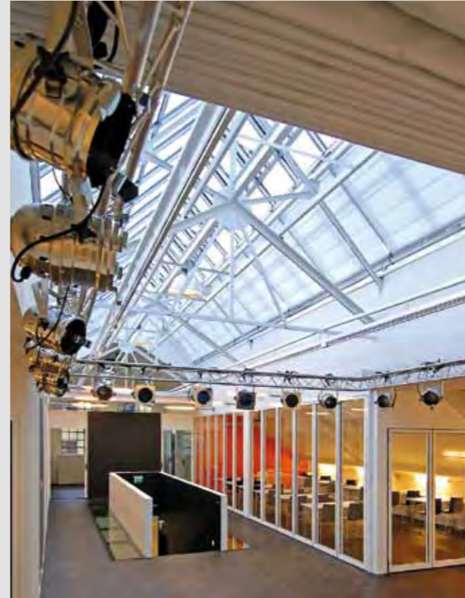
L'Oréal, Oslo, Norway

The interior designer had a tricky problem to solve with the relocation of the L'Oréal showroom: natural light in the new premises had to be adjusted to allow catwalk shows and product presentations during the day. The combination of two modern Silent Gliss skylight systems proved the ideal solution for darkening the former locomotive factory that dates back to 1860.