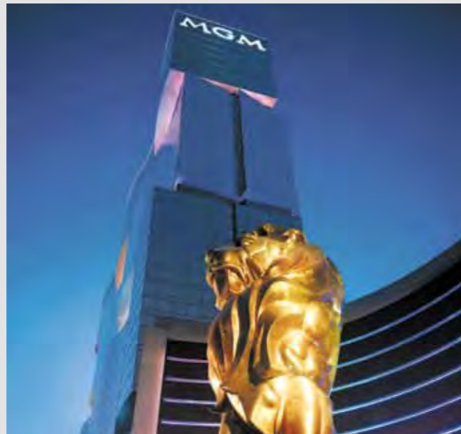
MGM Hotel-Casino, Macau, China