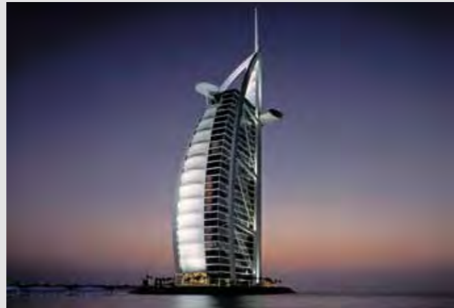
Burj al Arab, Jumeirah Beach, Dubai, UAE

Gleneagles Hotel, Perthshire, UK Puerta de America, Madrid, Spain Westin Hotels, Seoul / Shanghai Four Seasons, Riyadh / Hong Kong / UK / Amman Shangri La, Dubai / Muscat / Changchun Intercontinental Hotels, Doha / Beirut / Abu Dhabi / Muscat / Manila / Singapore Ritz Carlton, Doha, Qatar Accor Hotels, Europe Madina al Salam (Madinat), Dubai, UAE Marriott Hotels, Hamburg / Athens / Amsterdam / Cairo / Medina / Dubai / Amman The Waldorf Hotel, London, UK Amber Club, Zurich, Switzerland Lowry Hotel, Manchester, UK Hotel Medici, Rome, Italy Hotel de Keyser, Antwerp, Belgium Pulitzer Hotel, Amsterdam, The Netherlands Royal Viking Hotel, Stockholm, Sweden Parkhotel, Weggis, Switzerland Intercontinental Hotel, Cairo, Egypt Victoria Jungfrau, Interlaken, Switzerland Skydome Stadium/Hotel, Toronto, Canada Hyatt Xian A Fang, China Glass House Hotel, Edinburgh, UK Holiday Inn, Hilton and Raddison Hotels, UK Caesar's Palace, Las Vegas, USA MGM Grand Hotel, Las Vegas, USA New Furano Prince Hotel, Hokkaido, Japan Grand Hyatt Hotel, Taipeh, Taiwan Marriott Hotel, Gold Coast, Australia Chateau Gütsch, Luzern, Switzerland Tumba Gymnasium, Tumba, Sweden Hotel Ivoire, Abidjan, Ivory Coast MingJie Renaissance Hotel, Shanghai, China Kempinski Hotel, Munich, Germany Cardington House Hotel, Channel Islands Mandarin Oriental Hotel, Spain