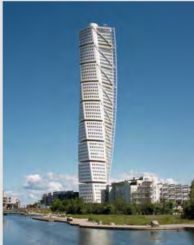
Turning Torso Tower, Malmö, Sweden