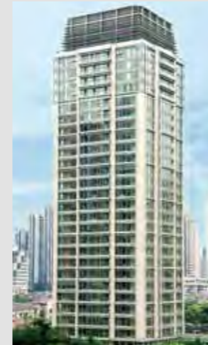
Residence 8, Shanghai, China

In this high-end apartment tower in Shanghai only the best materials and brands have been considered. Silent Gliss was the preferred partner for all motorised curtain and blind solutions on this project.