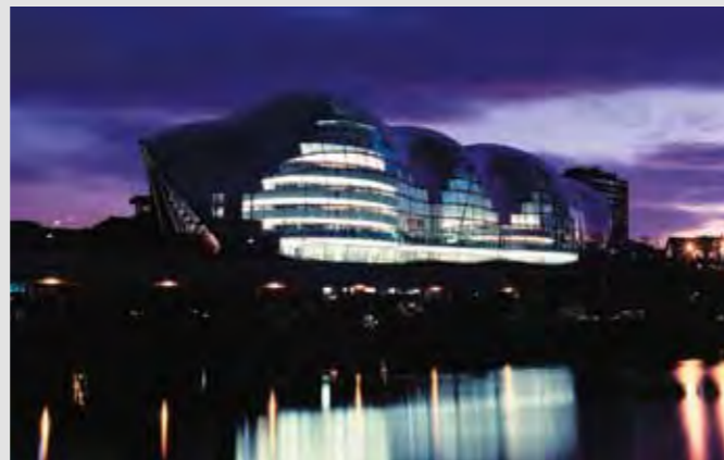
Sage Music Centre, Gateshead, UK