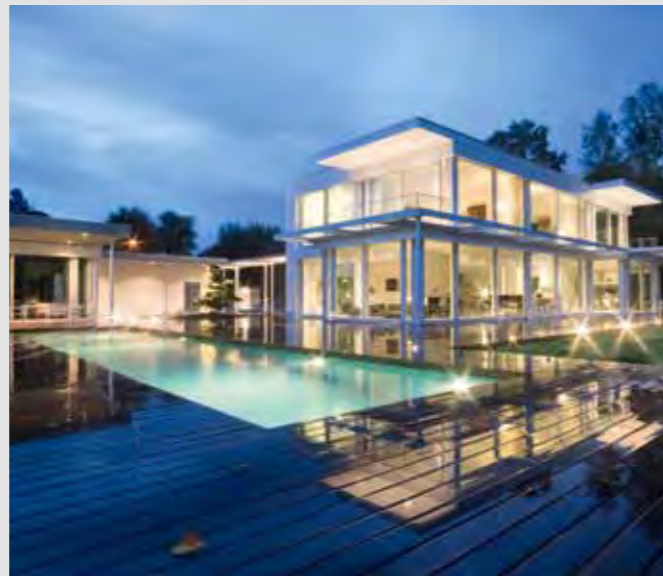
Casa Bianca, Bern, Switzerland