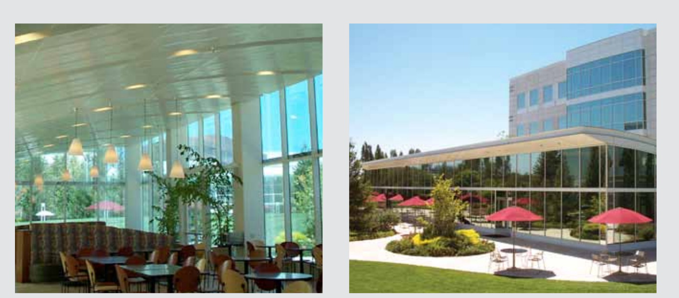
Cold Steel 35 inside and out