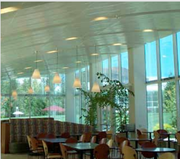
Cold Steel 35 inside and out