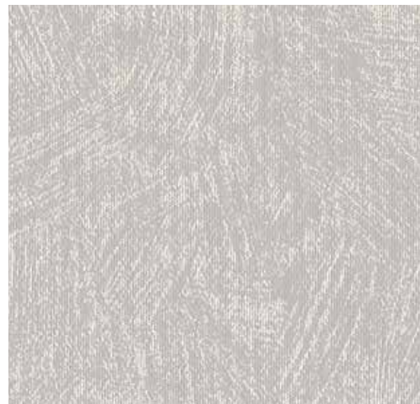
Romany Light Grey