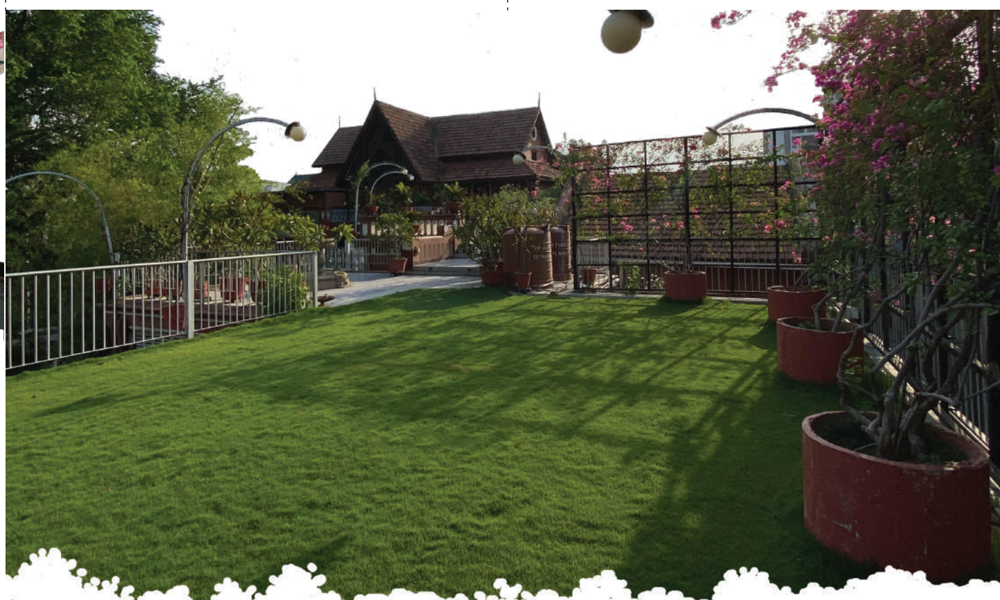
Gammat day care

We invite you to throw the perfect Birthday Party for your child in our pool area, open air lawns or indoor spaces. We offer you a choice of curated activities like puppetry, craft workshops, storytelling, treasure hunts and much more, especially designed to keep kids immersed, entertained and curious.