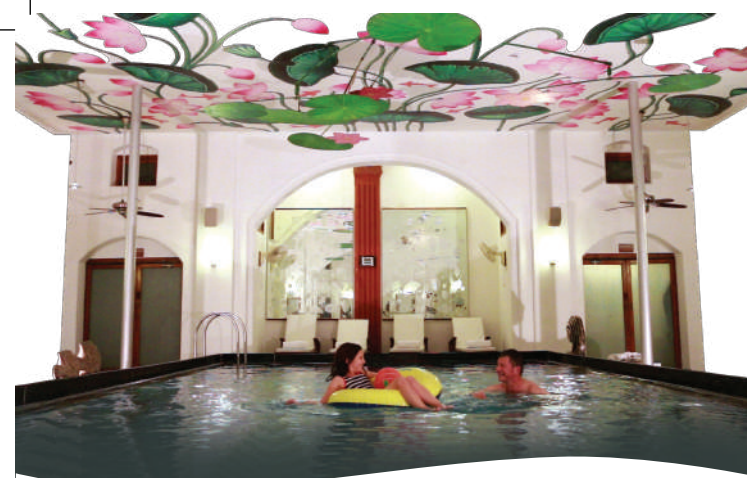
Shallow indoor pool for pool parties