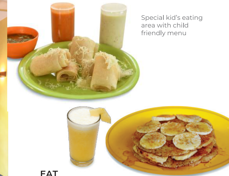
Special kid's eating area with child friendly menu