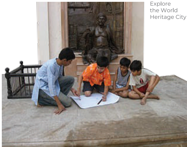
Explore the World Heritage City