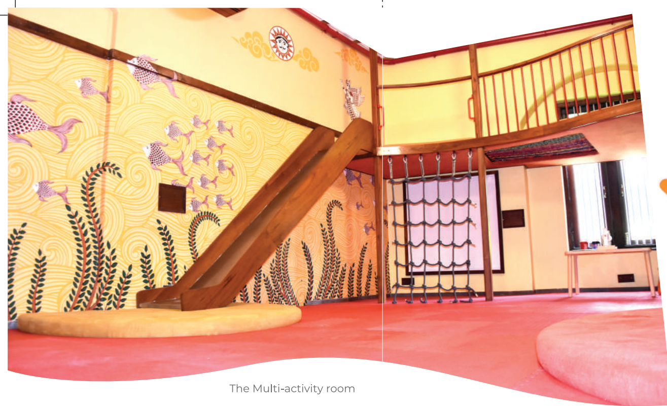
The Multi-activity room