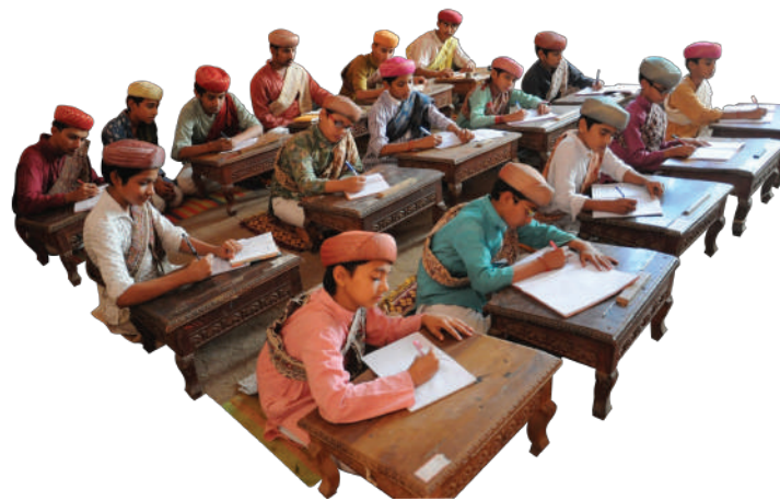
Visit unique local institutions

The House of MG organizes historical and cultural tours in and around Ahmedabad with its own English speaking guides and comfortable air conditioned vehicles. Visit our website www.houseofmg.com for more details.