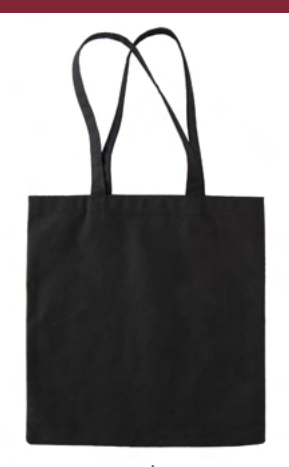
Black Tote + $1.00 per tote