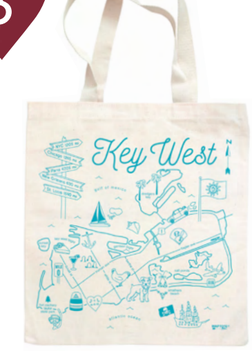
Create a new map or design