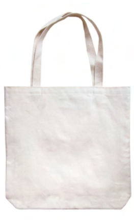
Market Tote + $4.00 per tote