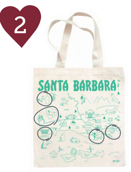
Add up to five locations or icons to existing design