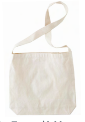
Hobo Tote + $2.00 per tote