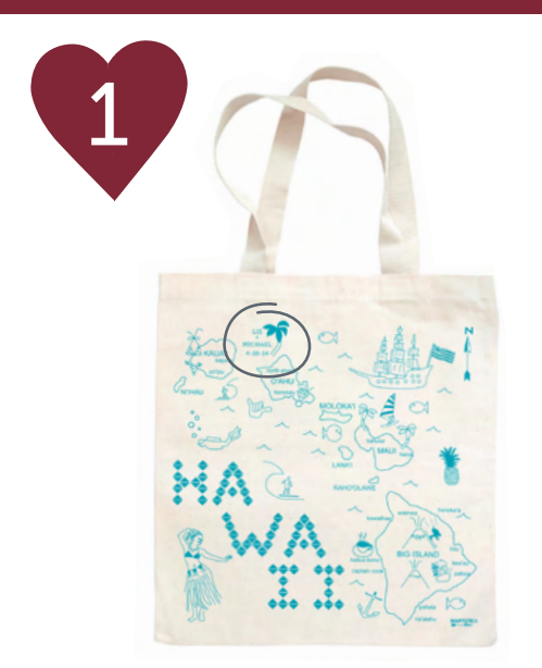
Add one location or icon to existing design