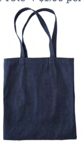
Denim Tote + $4.00 per tote