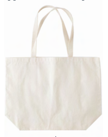
Beach Tote + $6.00 per tote