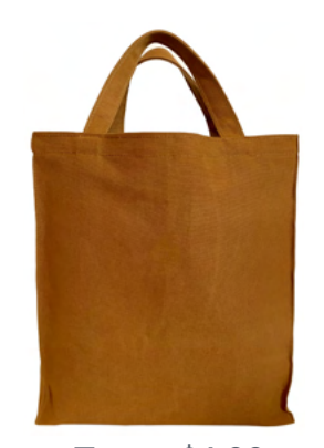
Shopper Tote + $4.00 per tote