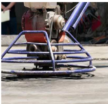
Prep Equipment & Power Tools