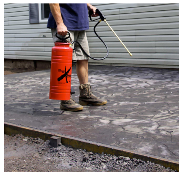
Sprayers & Building Materials