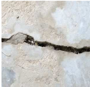
Bag Mix, Patching Mix, Grouts, Mortars