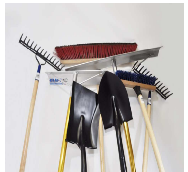
Brooms, Rakes, Shovels & Brushes