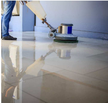
Chemicals & Cleaners