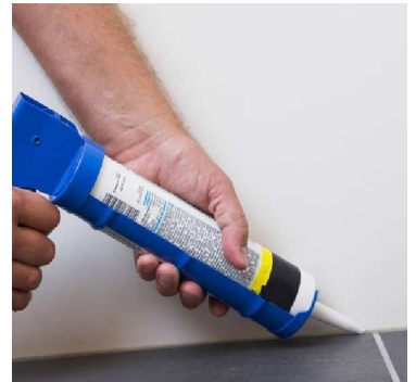
Caulkings, Sealants & Crack Repair