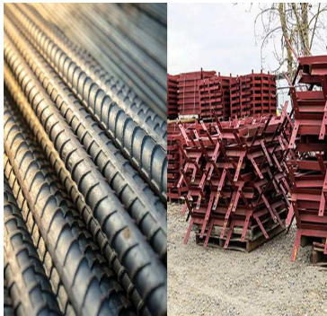
Brackets, Rebar & Fasteners