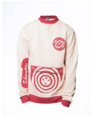
ZIPPER POUCH SWEATSHIRT