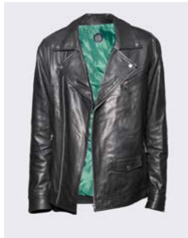
LEATHER BIKER JACKET