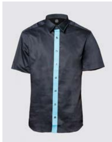
SATIN SLIM FIT BUTTON UP