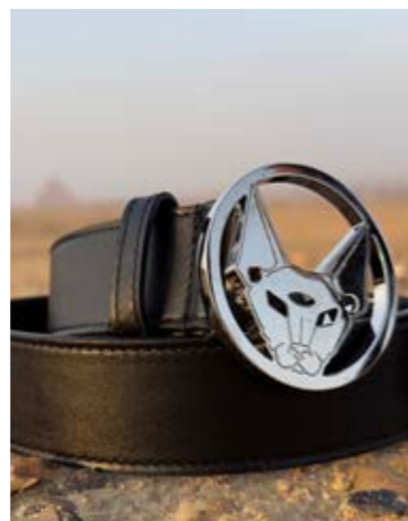
SCHEUNEMAN LOGO BELT