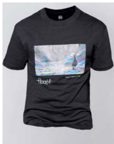
GOOSE PHOTO TEE