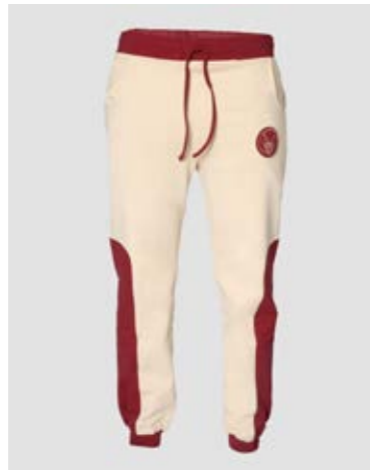
LOGO PATCH JOGGERS