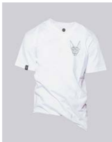
SCHEUNEMAN LOGO V-NECK