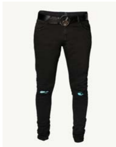
BLUE PATCH SKINNY JEANS