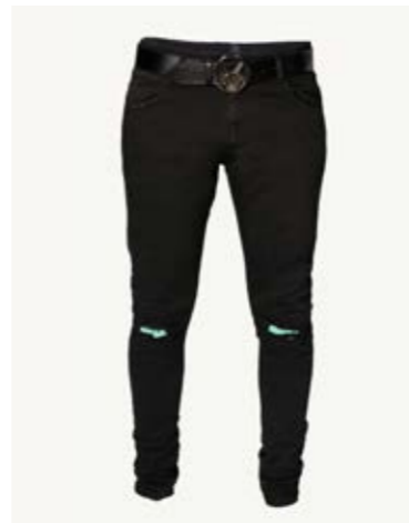
GREEN PATCH SKINNY JEANS