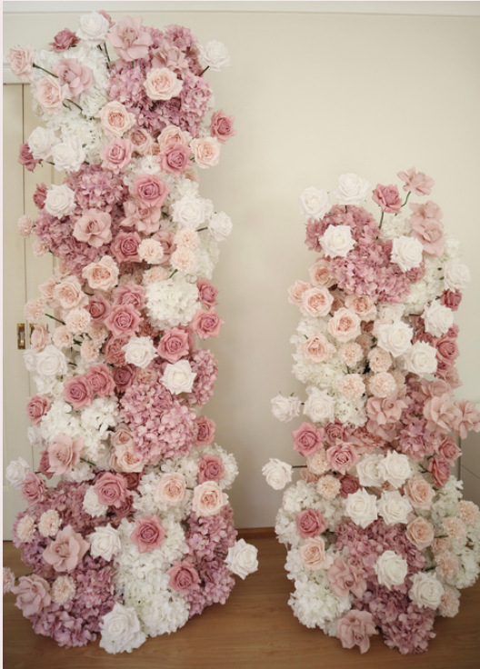
Blush pink freestanding pillars (pre-made)