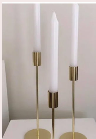
CANDLESTICKS available in black or gold - glass sleeves also included