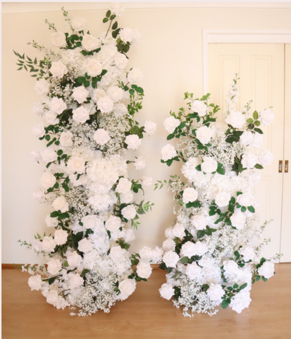
Classic freestanding pillars (pre-made)