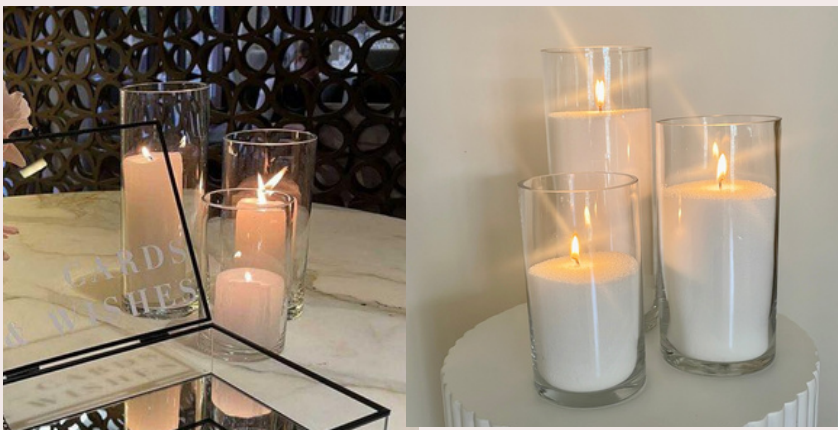
HURRICANE OR SAND