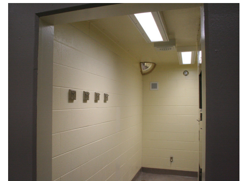
▶ Right Angle Corridors