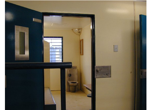
▶ Safe Inmate Inspection