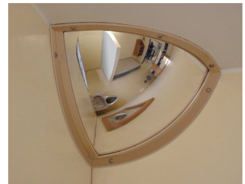
▶ Cell Observation