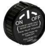
Flame Sense On/Off Cover OPT-FSOC