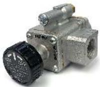
Flame Sense Gas Valve OPT-FSGV