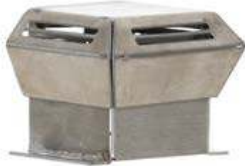
Flame Sense Pilot Hood OPT-FSPH