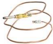
Flame Sense Thermocoupling OPT-FSTC