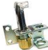
Flame Sense Pilot OPT-FSPL-NG OPT-FSPL-LP