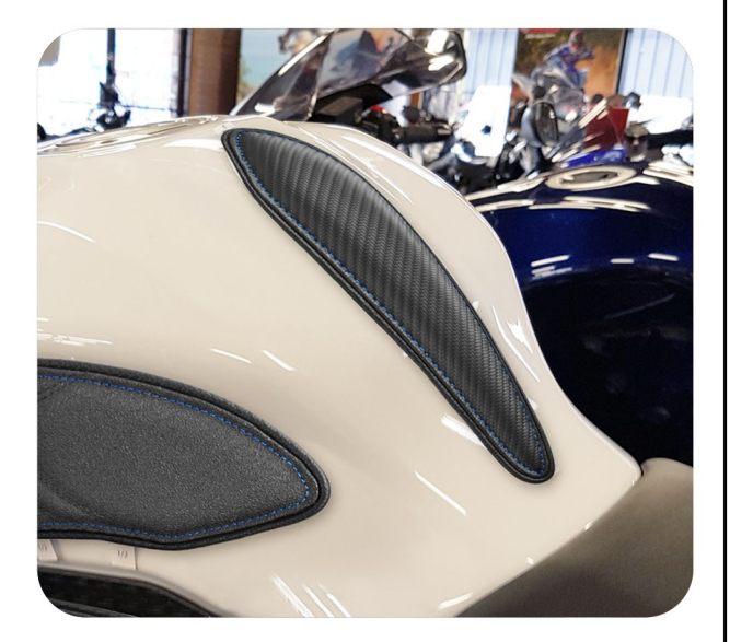
Reference Photo Only

Carefully peel off the backing paper from the grey 3M double sided tape and press the Tank Protector down accurately and firmly in between the templates and any additional reference points. Press continuously everywhere for 30 to 50 seconds.