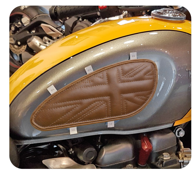
Example of Right Side