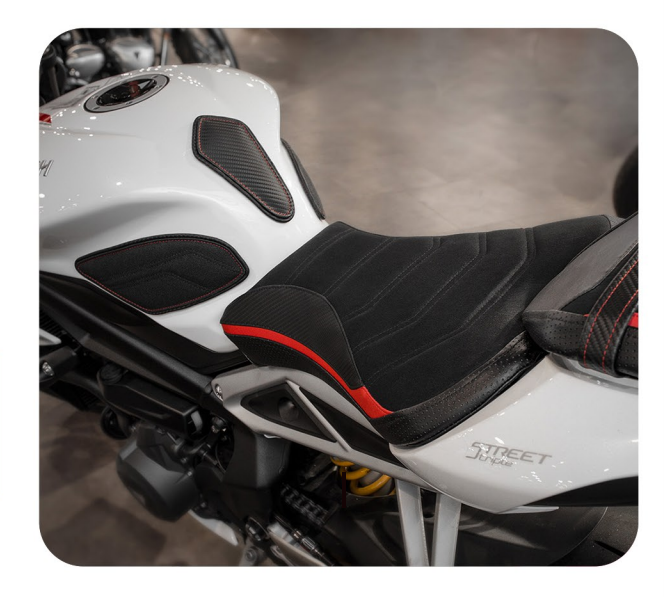
Reference Photo Only

Carefully peel off the backing paper from the grey 3M double sided tape and press the Tank Protector down accurately and firmly in between the templates and any additional reference points. Press continuously everywhere for 30 to 50 seconds.