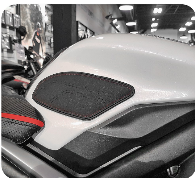
Example of Right Side