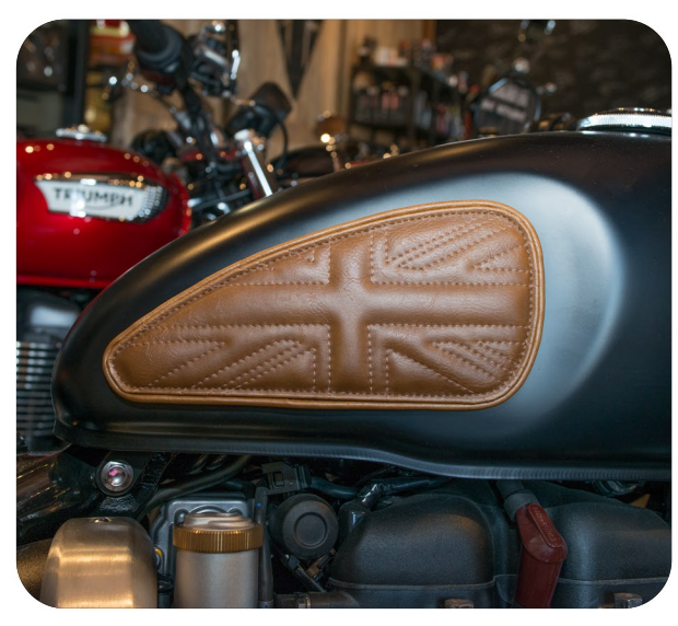
Example of Right Side