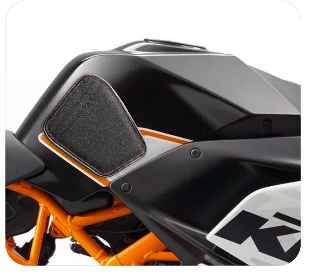
Example of Right Side