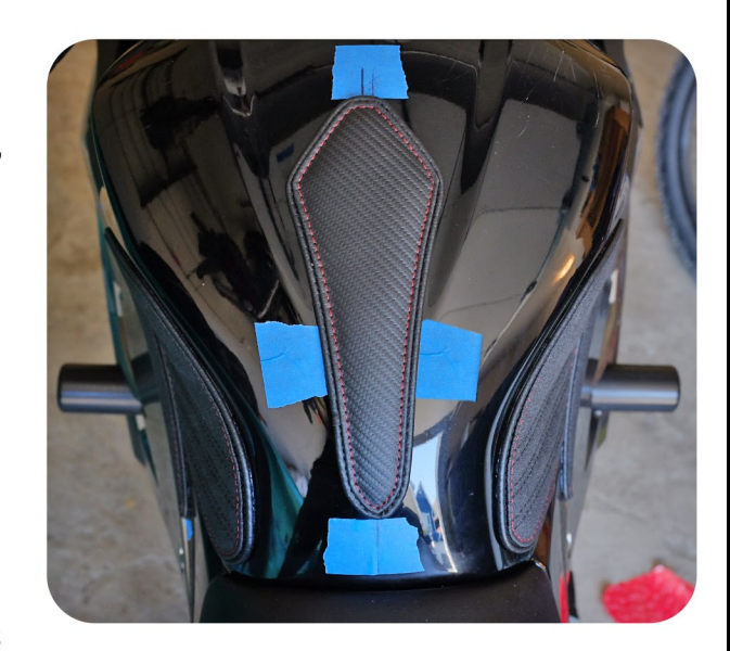
Reference Photo Only

Carefully peel off the backing paper from the grey 3M double sided tape and press the Tank Protector down accurately and firmly in between the templates and any additional reference points. Press continuously everywhere for 30 to 50 seconds.