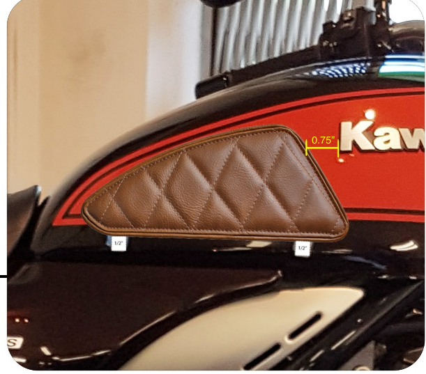
Example of Right Side This is only a recommendation. If it doesn't look right to you, you may place it however you like.