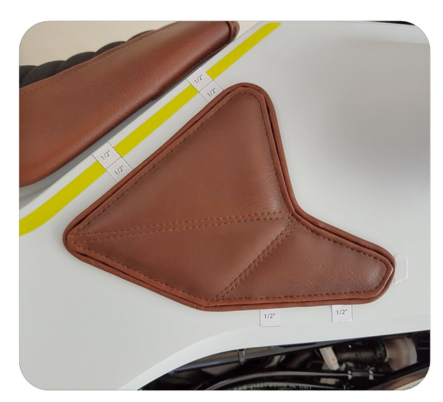
Example of Right Side