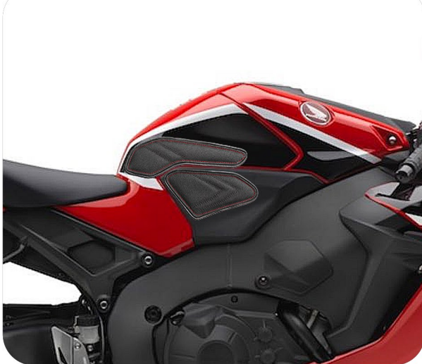
Example of Right Side