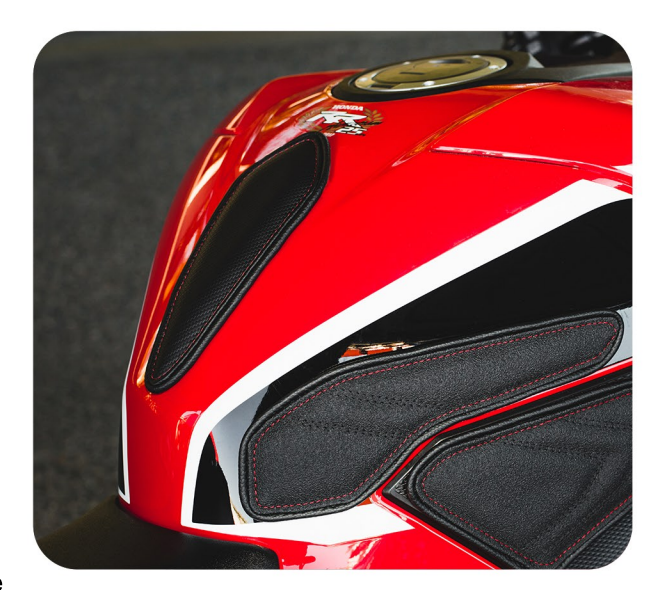
Reference Photo Only

Carefully peel off the backing paper from the grey 3M double sided tape and press the Tank Protector down accurately and firmly in between your reference points. Press continuously everywhere for 30 to 50 seconds.