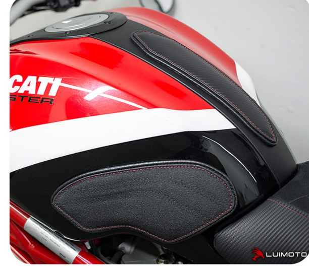
Install example of left side

Carefully peel off the backing paper from the 3M double sided tape, line up the Tank Leaf to the edges of the spacer squares, and press down. Put firm pressure from the center and then out with your hands. Press firmly and continuously all around for 30 to 50 seconds. Repeat steps for the other side.