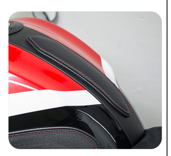
Reference Photo Only

Carefully peel off the backing paper from the grey 3M double sided tape and press the Tank Protector down accurately and firmly in between the templates and any additional reference points. Press continuously everywhere for 30 to 50 seconds.