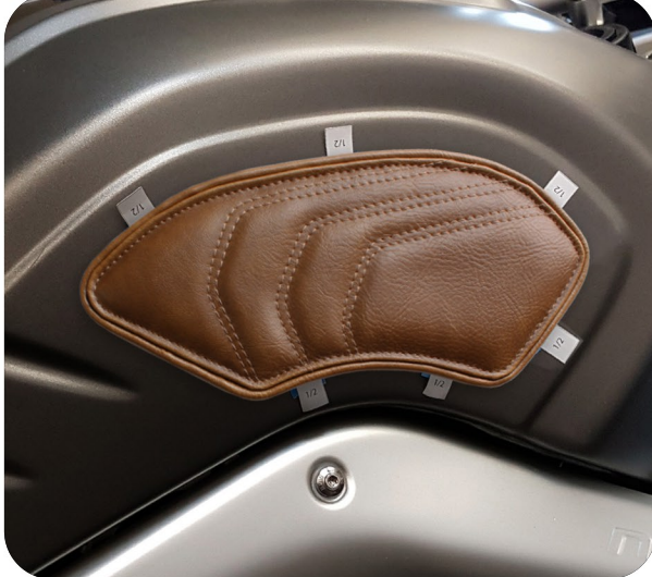
Example of Right Side