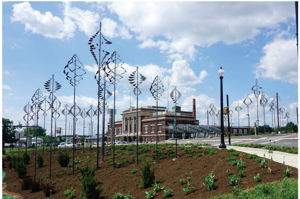
Lititz Pike Bridge, Lancaster, PA.

Edgerton Hospital, Edgerton, WI. Four elements (10-13 feet)