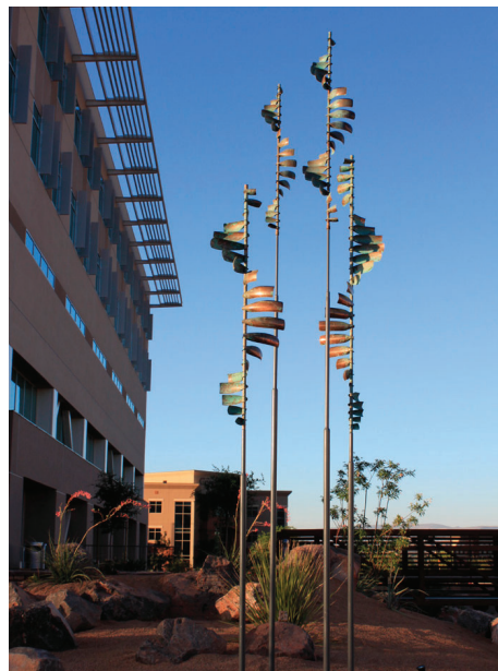
DRMC Health & Performance, St. George, UT.

La Posada, Santa Fe, NM. Fifteen elements (10-23 feet)