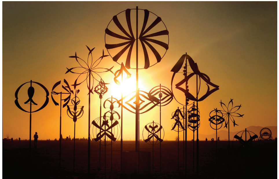
Kinetic Metamorphosis at Burning Man, Black Rock City, NV.

Sol Foods Market/Cafe, Springdale, UT. Three elements (11-13 feet)