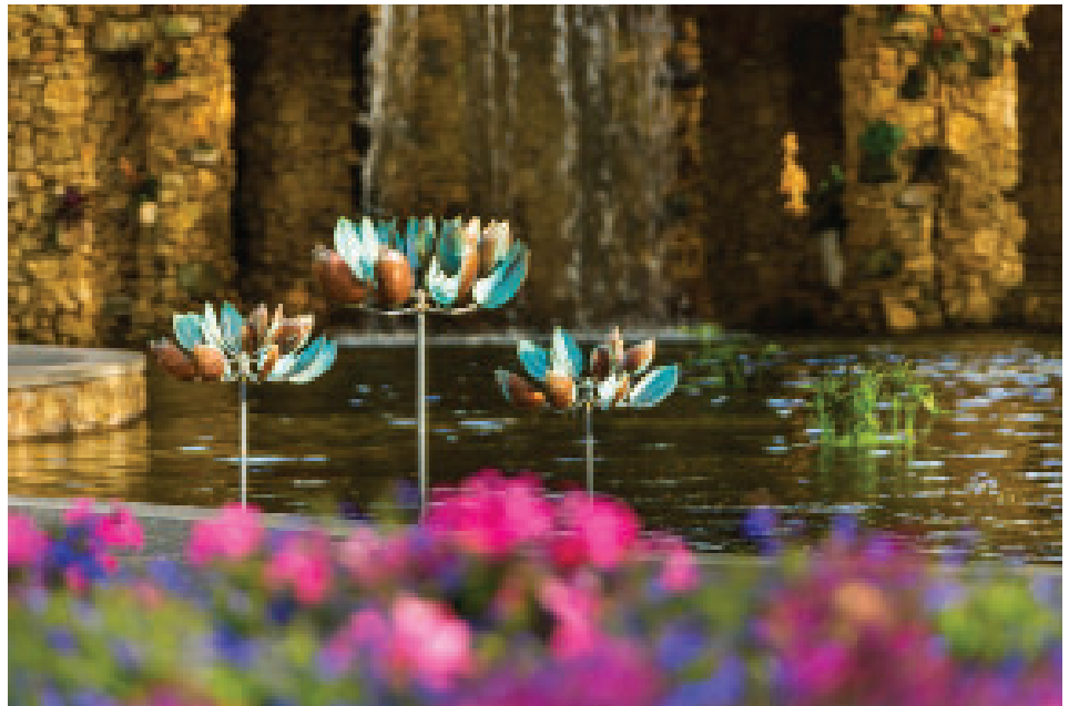
Dallas Arboretum, Dallas, TX.

Yampa River Park, Steamboat Springs, CO. One sculpture (17 feet)