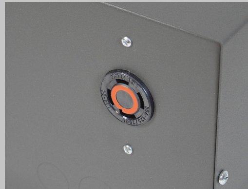
Twist-Lock Outlets and Plugs