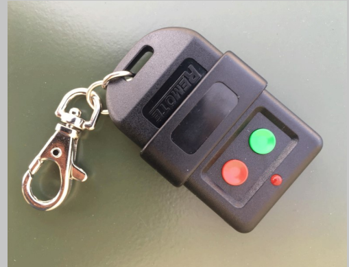
Wired and Wireless Remote Switches