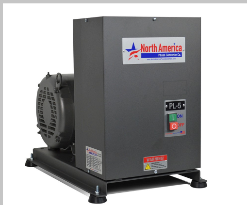
Floor Mounting Kits