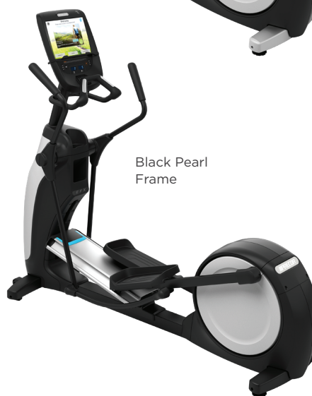
Black Pearl Frame

Refined colorways with dark Tungsten covers and two frame color options.