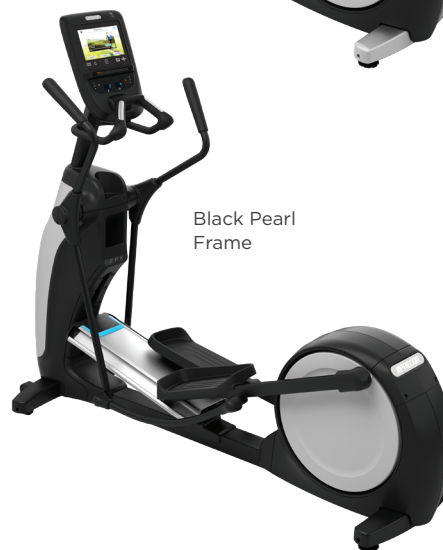
Black Pearl Frame

Refined colorways with dark Tungsten covers and two frame color options.