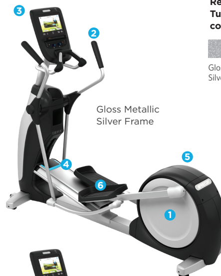
Gloss Metallic Silver Frame

The low step-up height improves accessibility and the optimized pedal spacing provides a more natural and comfortable feel.