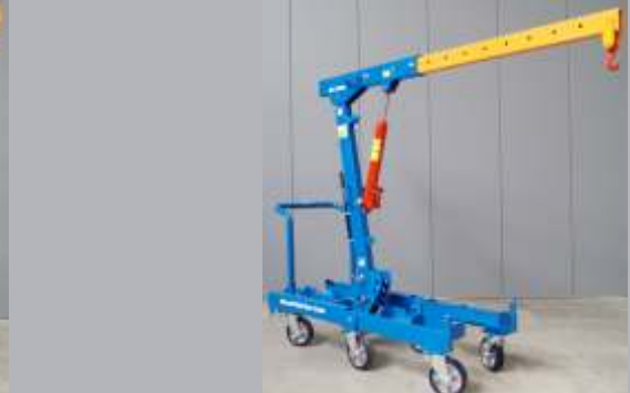
MFC 750 Mini Floor Crane